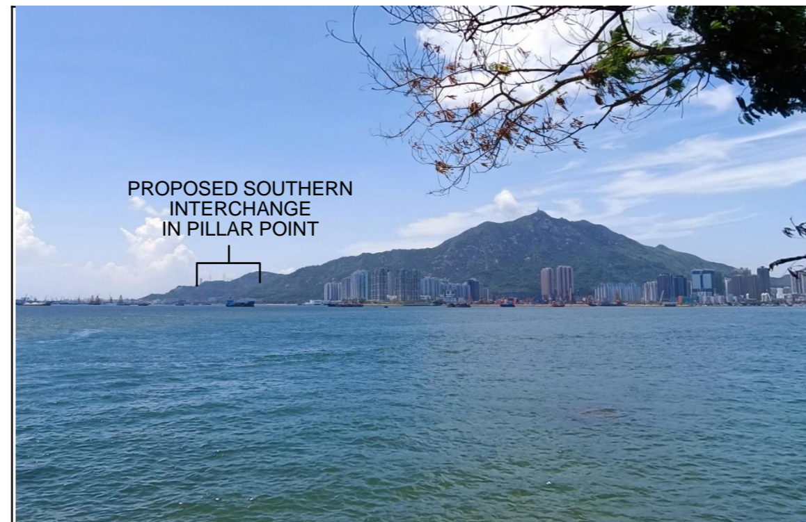
YEAR 10 WITH MITIGATION MEASURES

NOTES: 1. PLEASE REFER TO FIGURE 11.11.1 AND 11.11.2 FOR LOCATION OF VIEWING POINT.