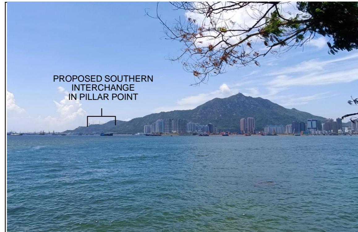
DAY 1 WITHOUT MITIGATION MEASURES