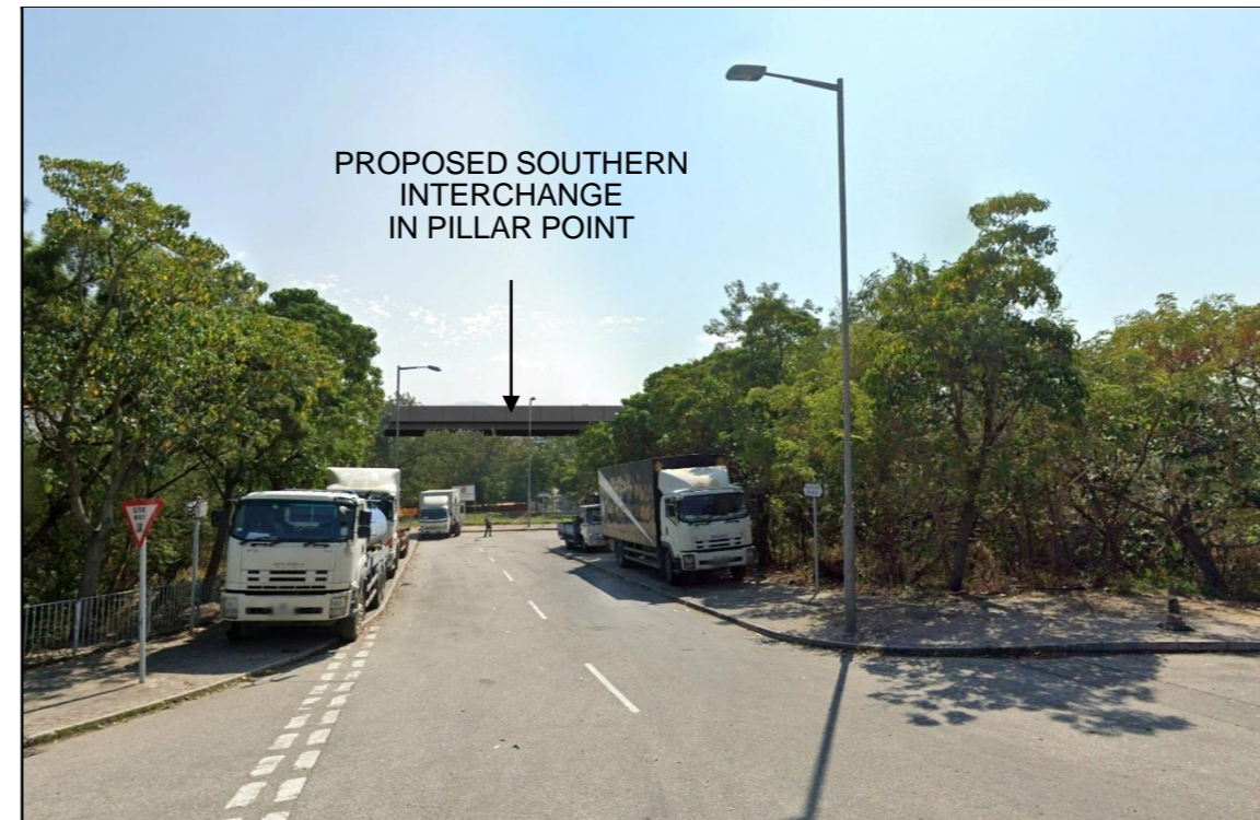
DAY 1 WITHOUT MITIGATION MEASURES