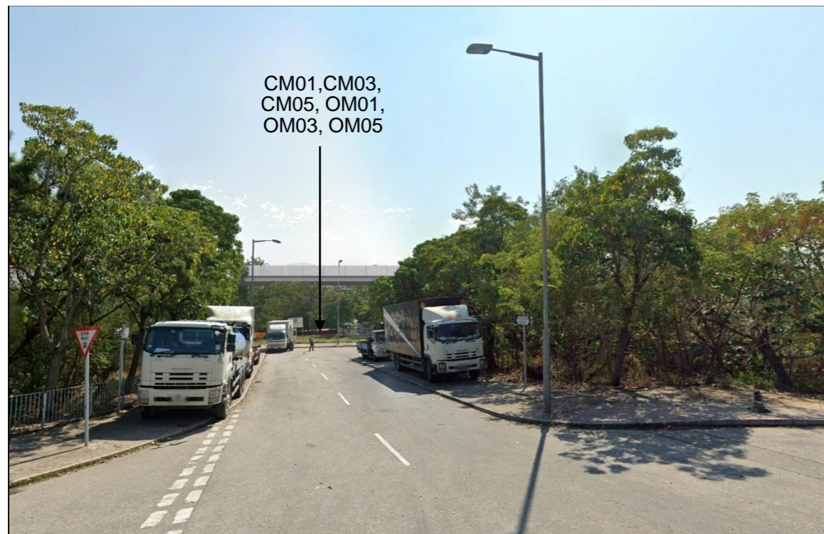
DAY 1 WITH MITIGATION MEASURES