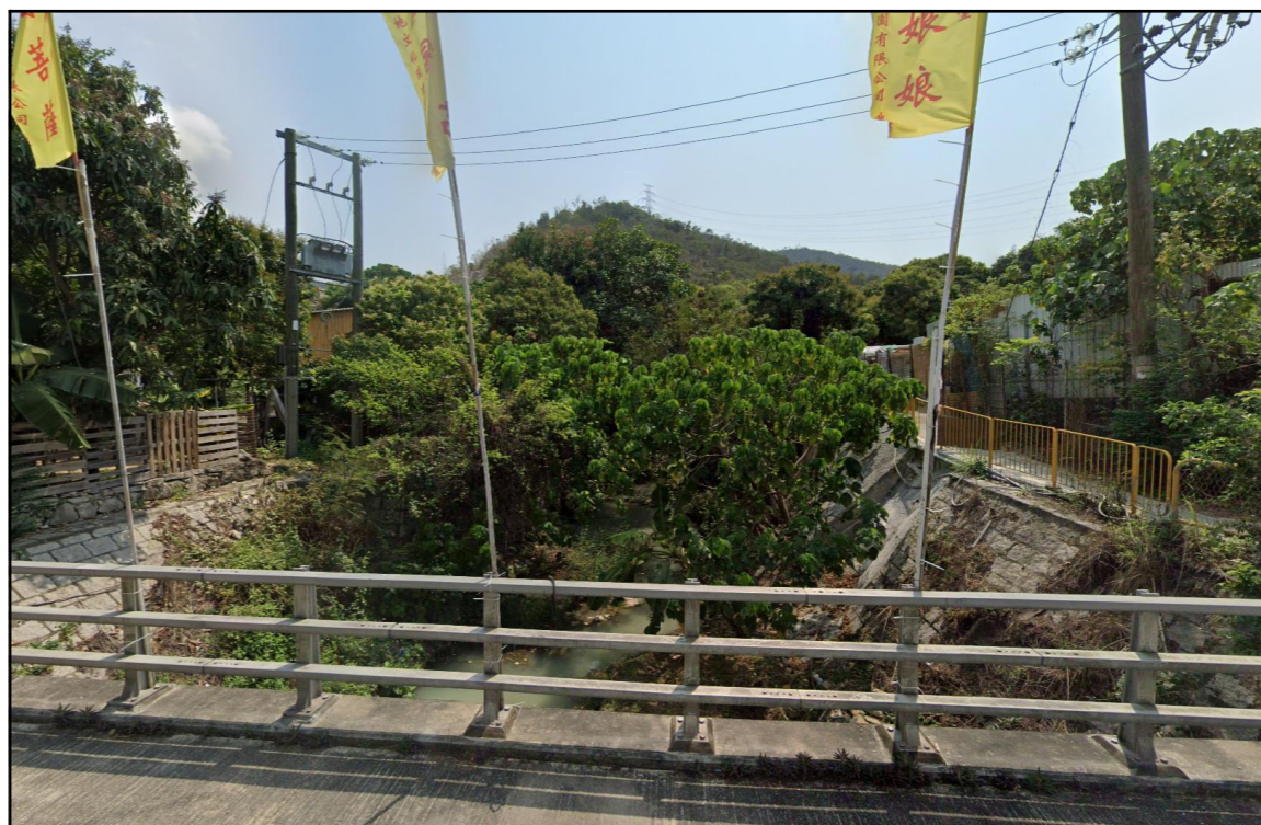
LR-LT7 – Watercourses in Lam Tei