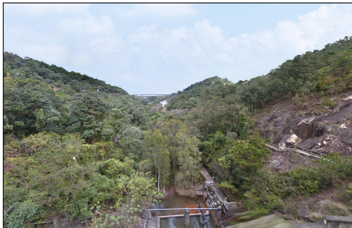
LR-LT7 – Watercourses in Lam Tei