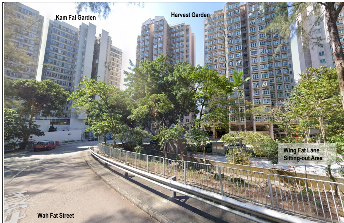
Wah Fat Street