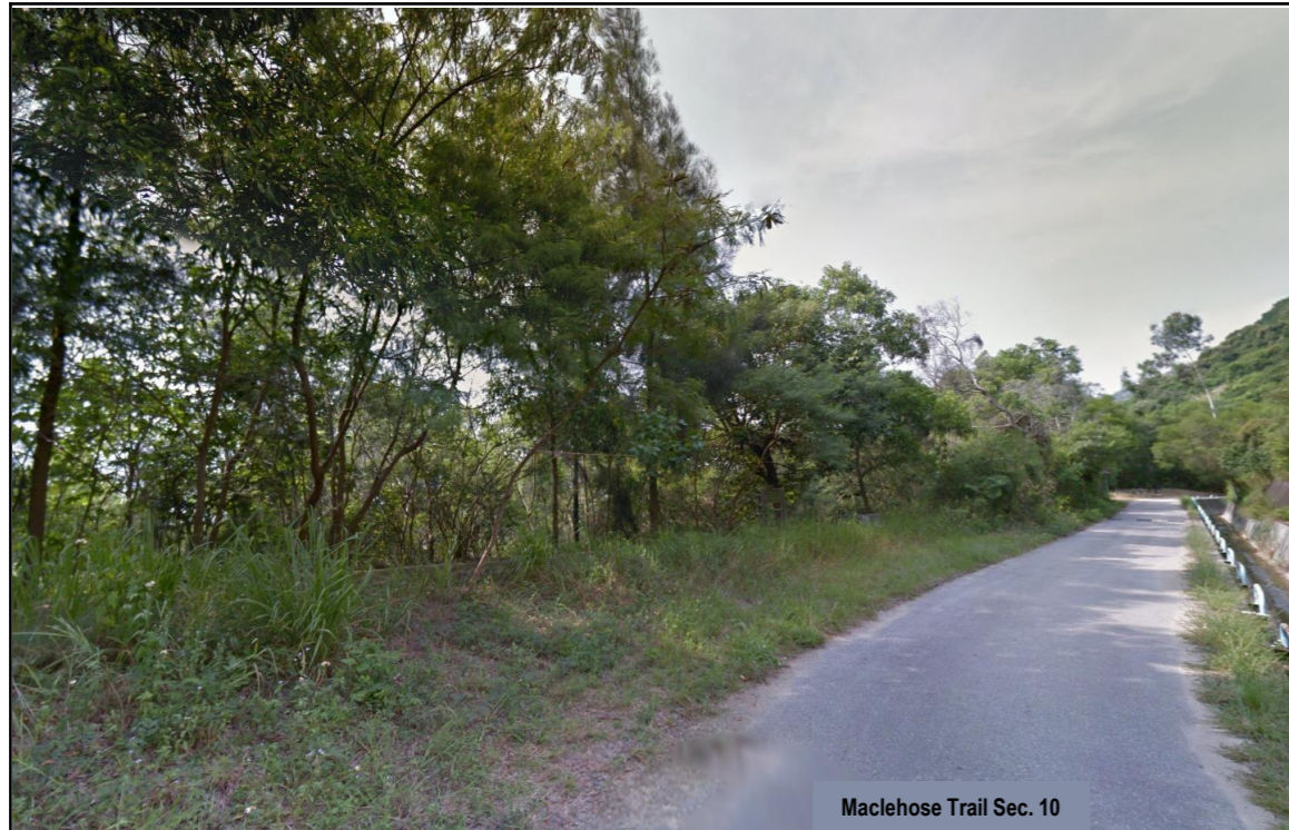
Maclehose Trail Sec. 10