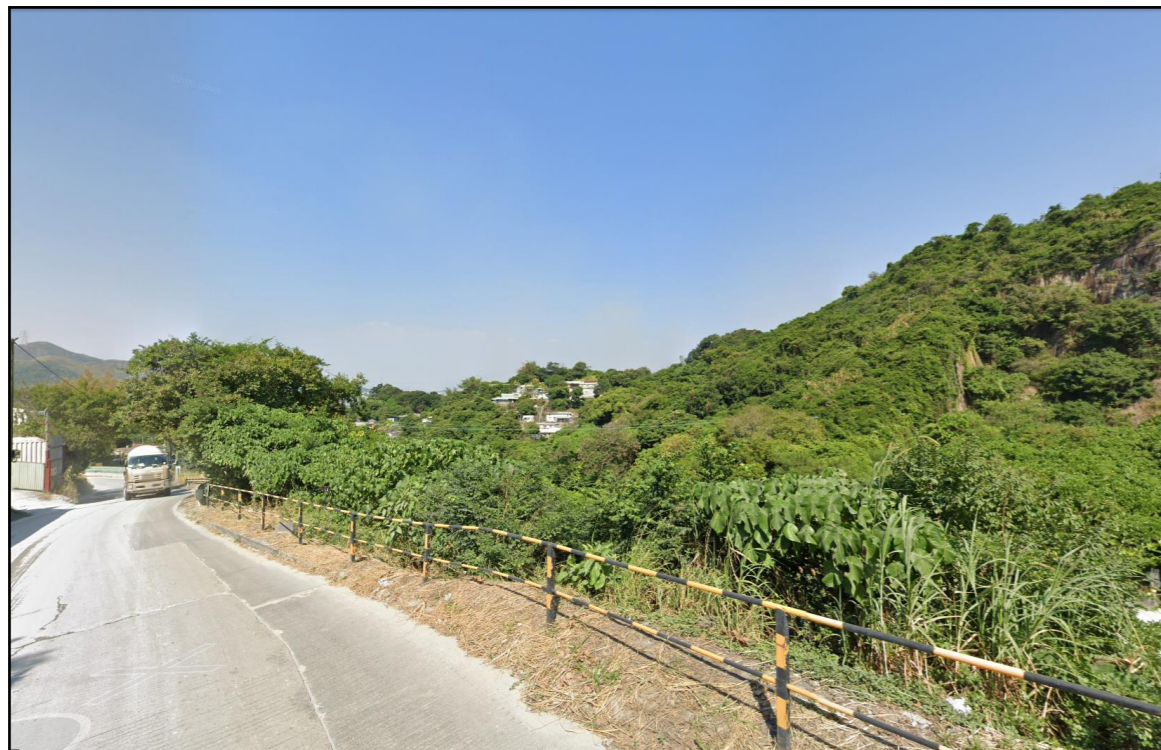
LR-LT1 – Secondary Woodlands in Lam Tei