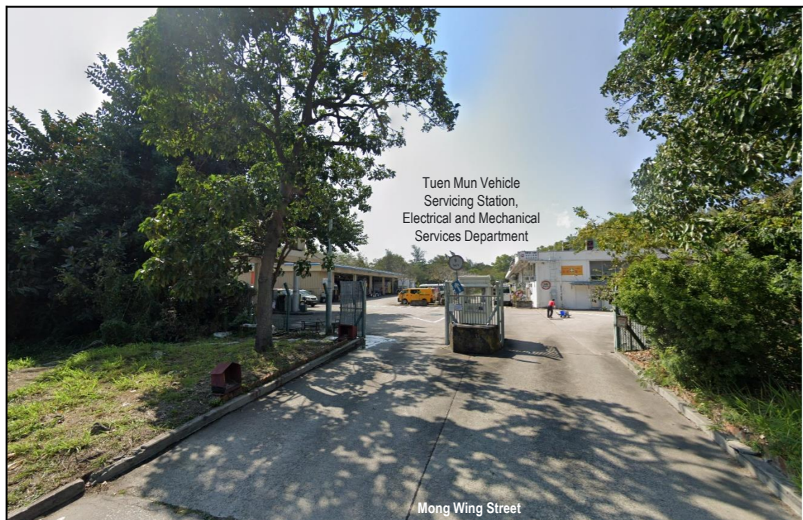
Tuen Mun Vehicle Servicing Station, Electrical and Mechanical Services Department