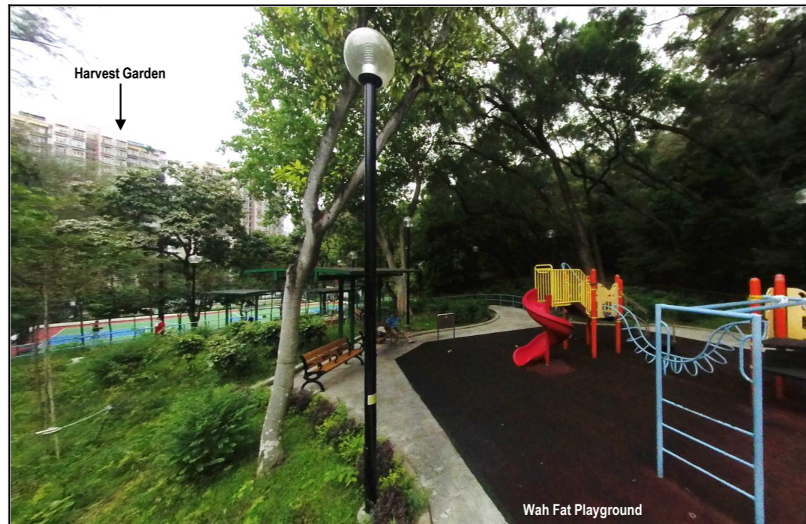
Wah Fat Playground