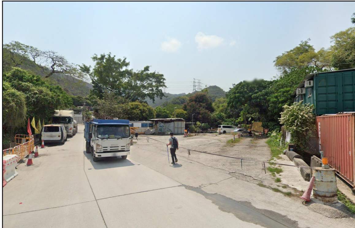
LR-LT11 – Developed Areas in Lam Tei