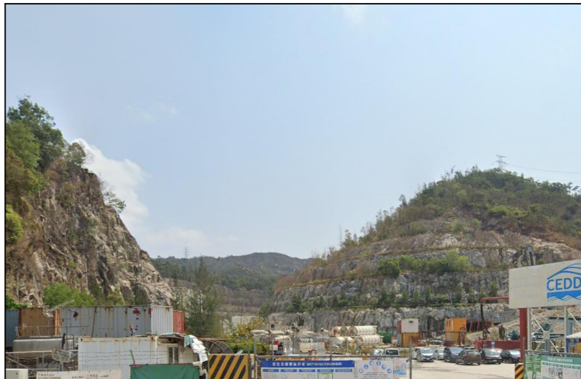
LR-LT2 – Plantations in Lam Tei