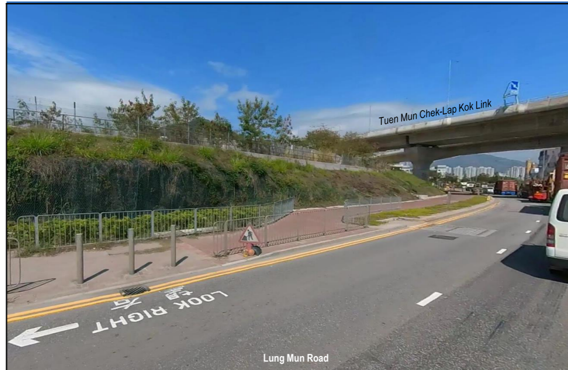
Lung Mun Road