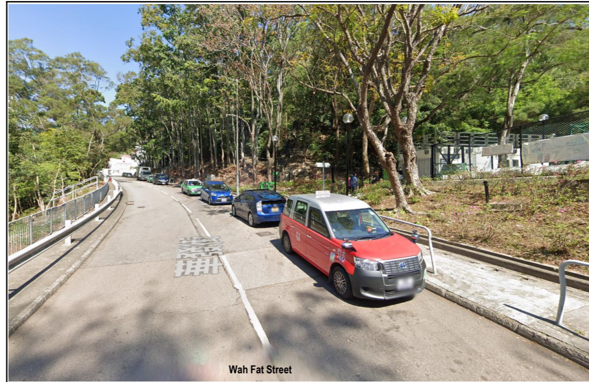
Wah Fat Street