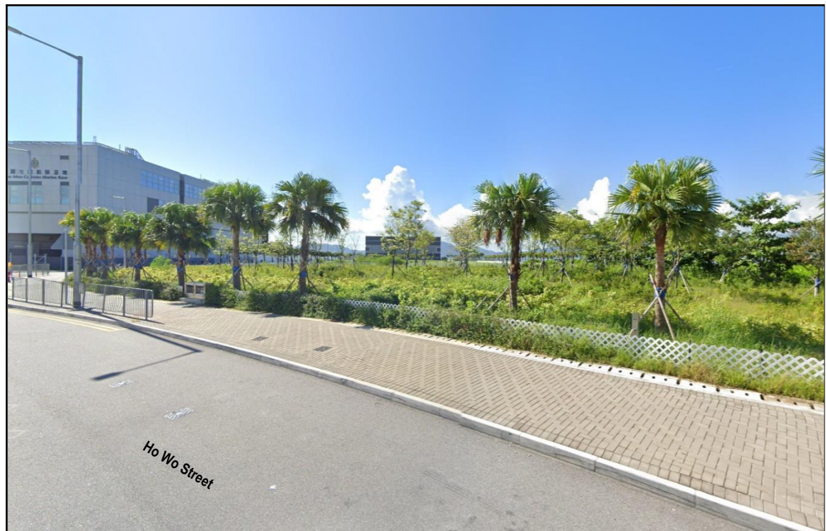
LR-NL2 – Plantations in Northern Landfall