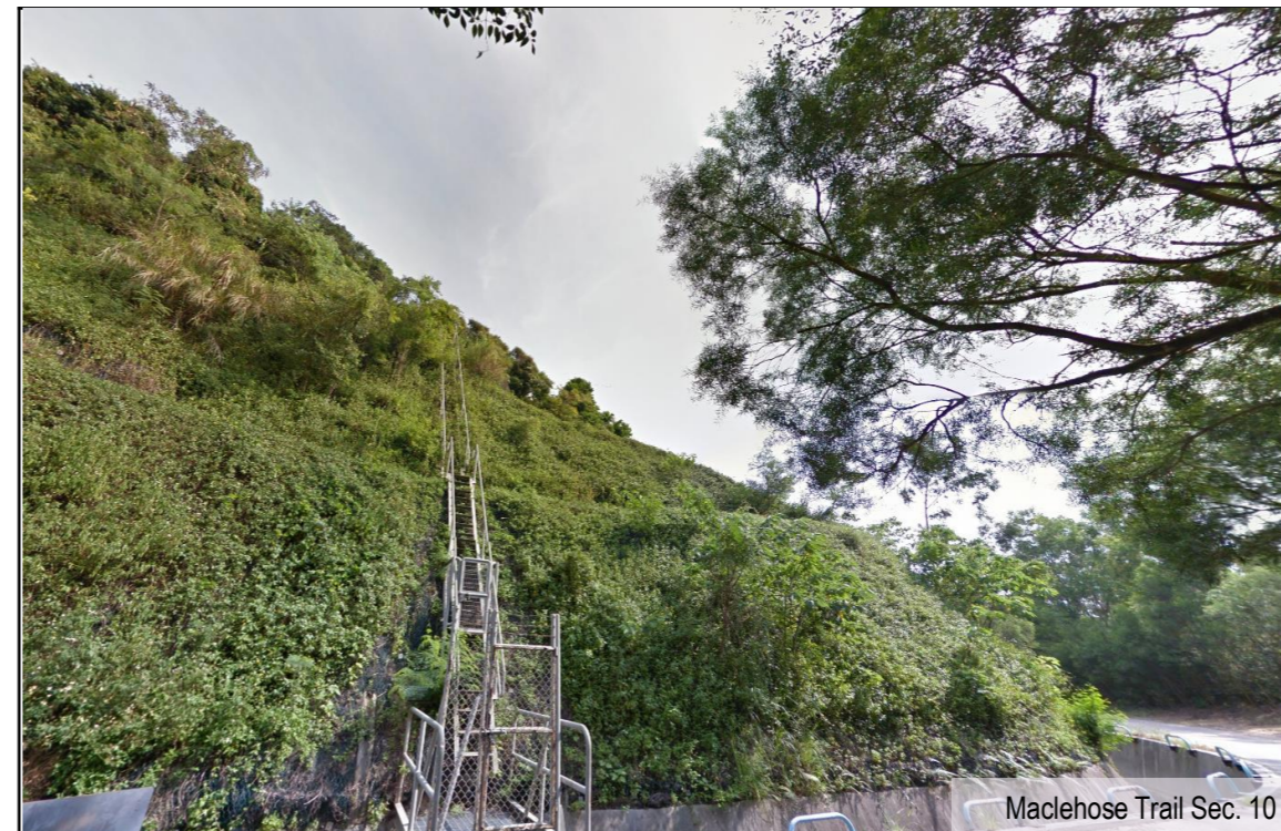
LCA-TM4 – Tuen Mun Upland Landscape