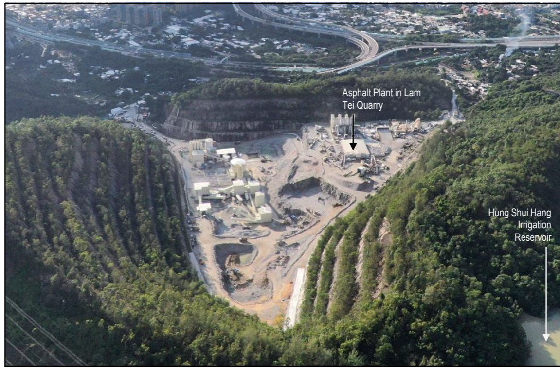
LCA-LT3 – Lam Tei Rural Landscape