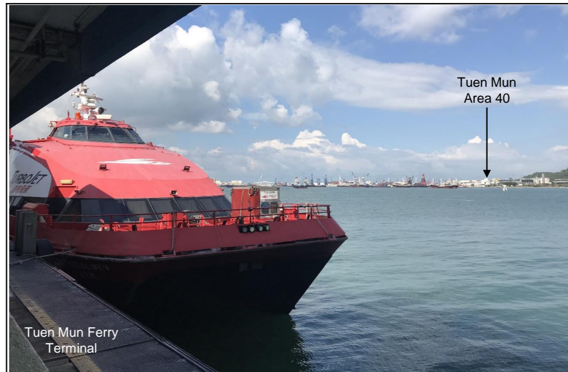
VSR-TM6 – Maritime Travelers to / from Tuen Mun Ferry Terminal