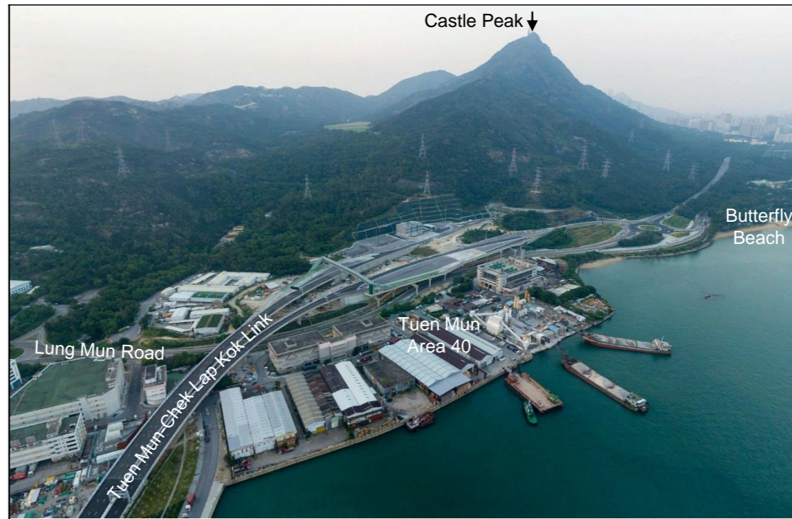
VSR-PP4 – Workers and Future Residents at Tuen Mun Area 40