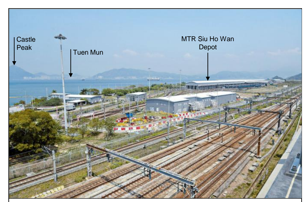
VSR-NL3 – Workers and Future Residents at MTR Siu Ho Wan Depot