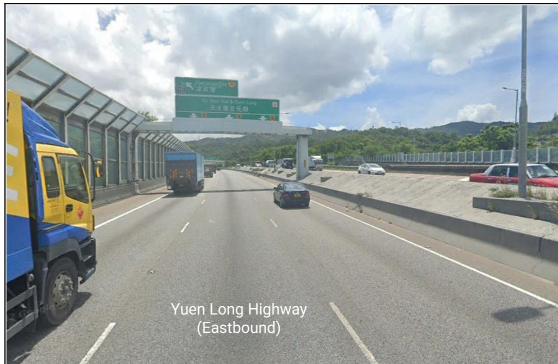
VSR-LT2 – Vehicle Travelers on Yuen Long Highway (Eastbound)