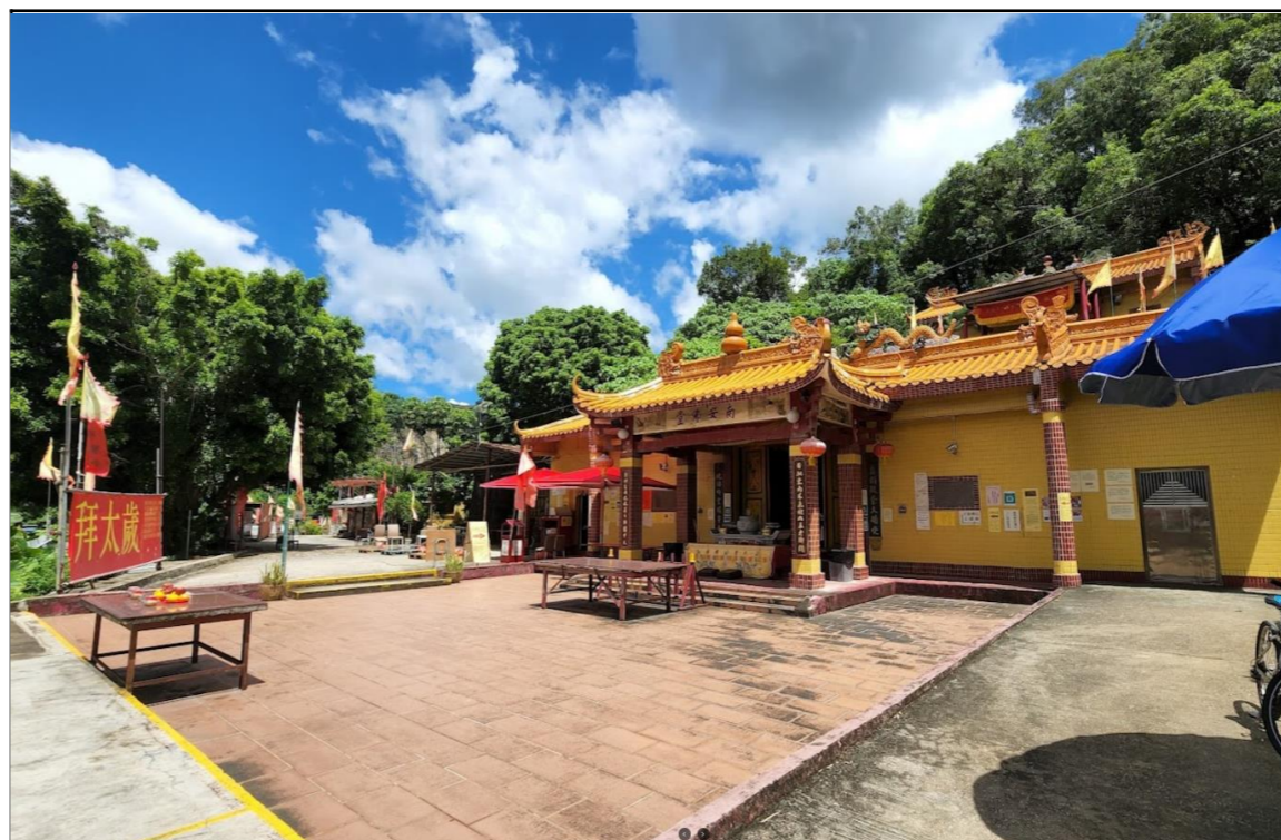
VSR-LT4 – Visitor of Nam On Fat Tong in Fu Fuk Road