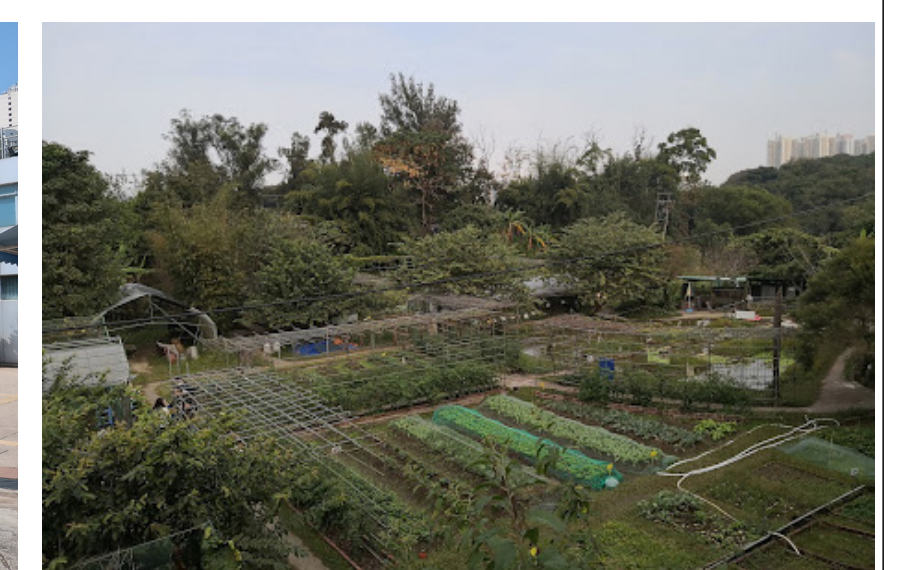
LR7.3 - TRANING FACILTIES