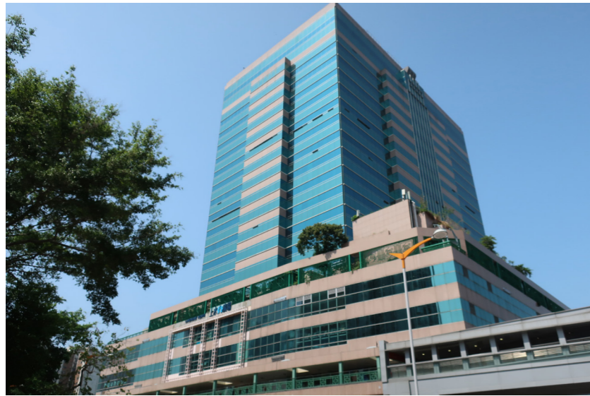
LR11.1 - SHOPPING MALL