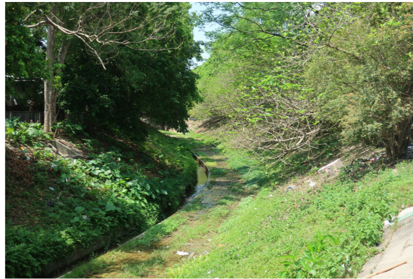
LR12.1 - RIVER CHANNEL