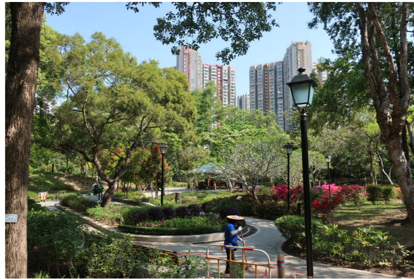
LCA2 - PARK URBAN LANDSCAPE