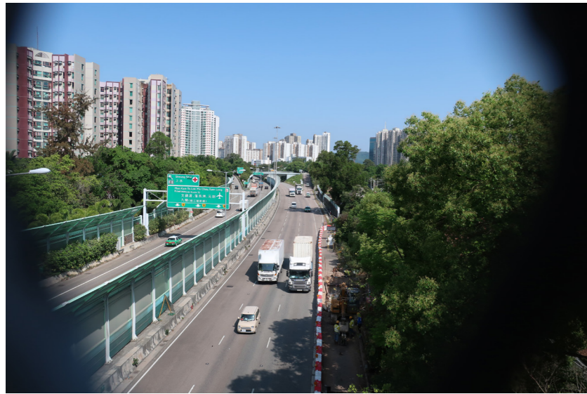
LCA1 - TRANSPORTATION CORRIDOR LANDSCAPE