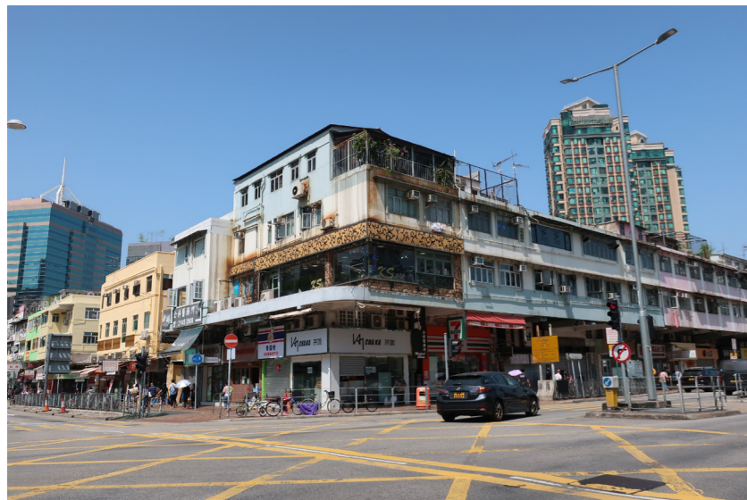
LCA4 - "HUI" URBAN LANDSCAPE