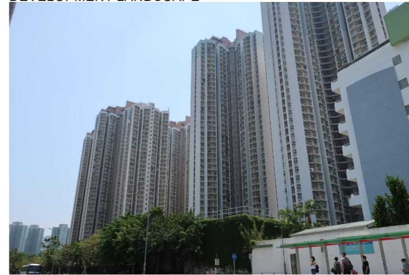
LCA3 - MIXED MODERN COMPREGENSIVE URBAN DEVELOPMENT LANDSCAPE