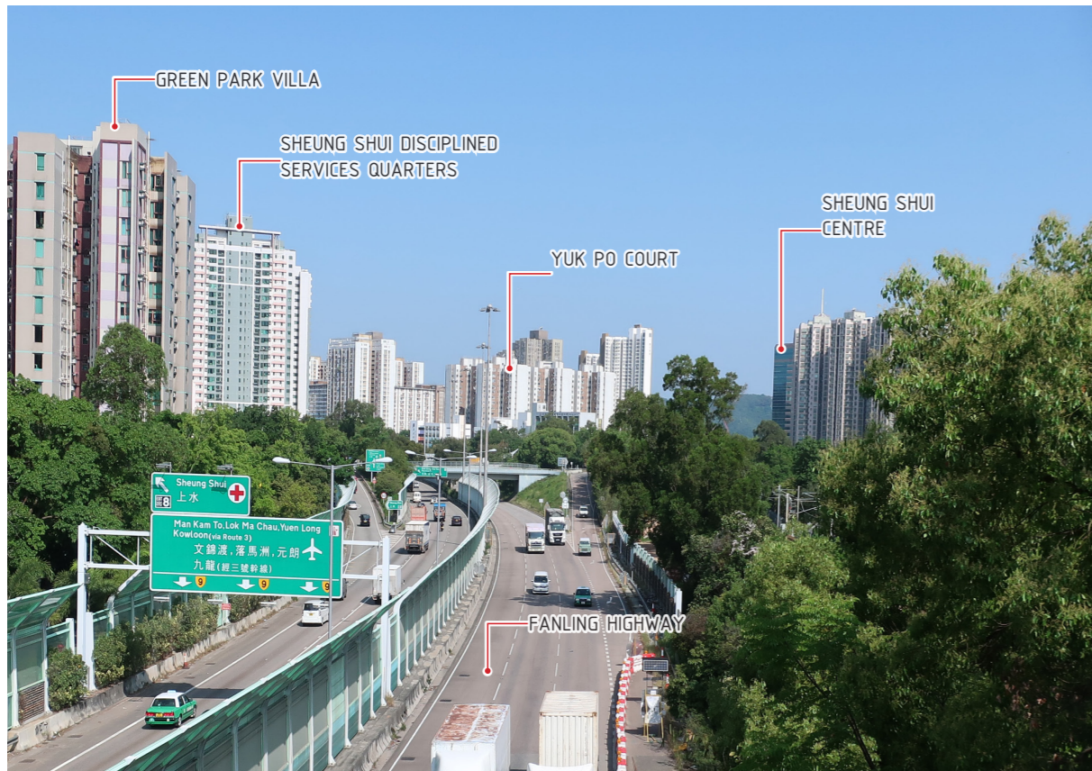
VP01 - FOOTBRIDGE AT FANLING HIGHWAY EXISTING CONDITION