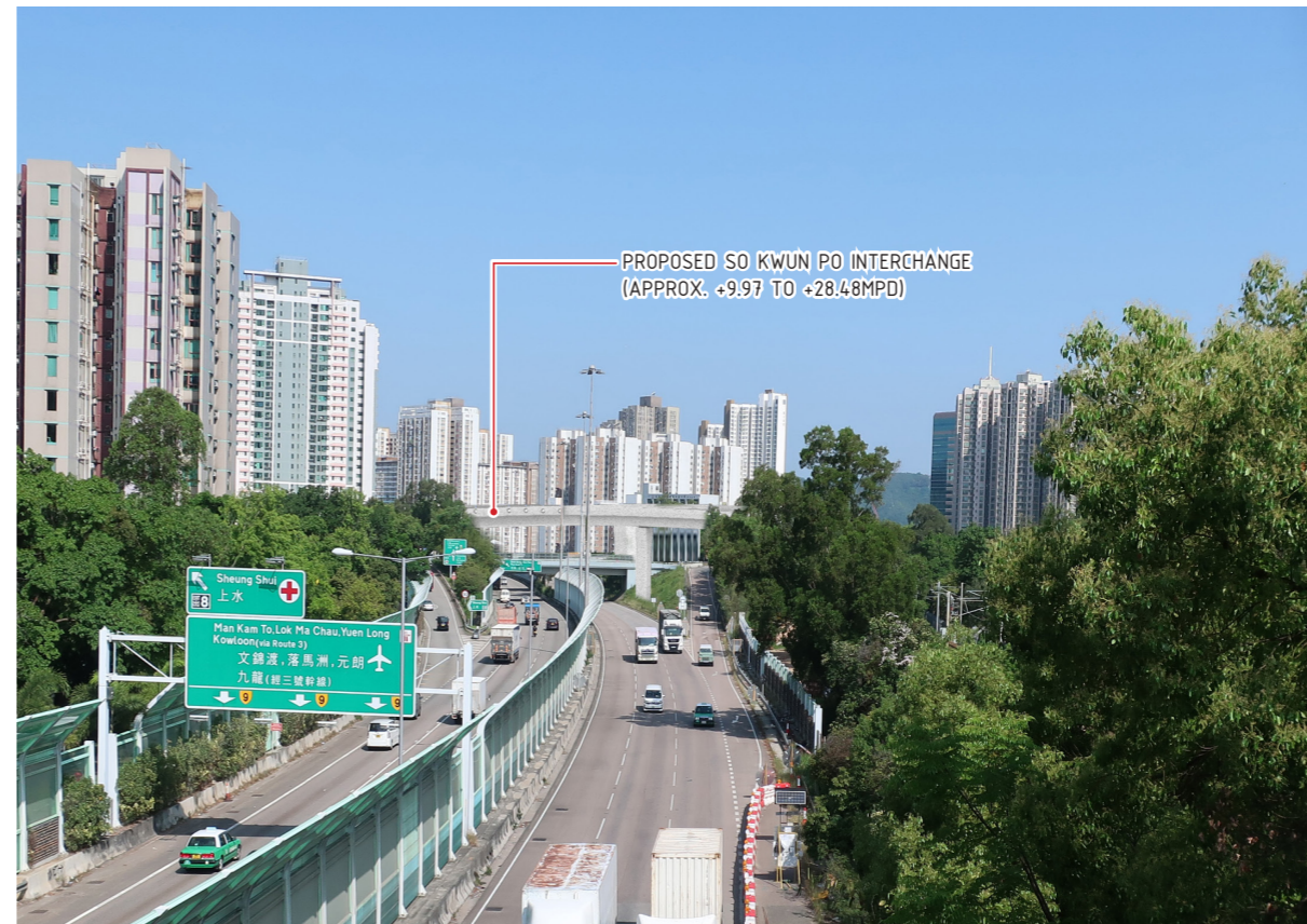
VP01 - FOOTBRIDGE AT FANLING HIGHWAY WITHOUT MITGATION MEASURES