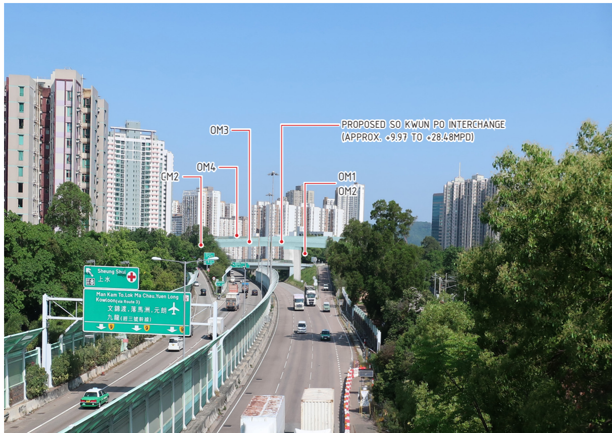
VP01 - FOOTBRIDGE AT FANLING HIGHWAY DAY 1 WITH MITGATION MEASURES