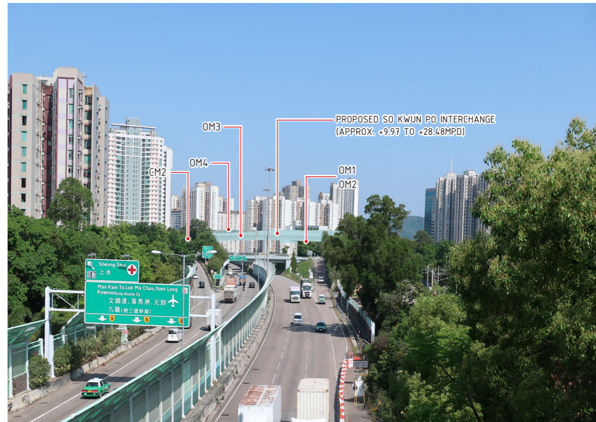
VP01 - FOOTBRIDGE AT FANLING HIGHWAY YEAR 10 WITH MITGATION MEASURES