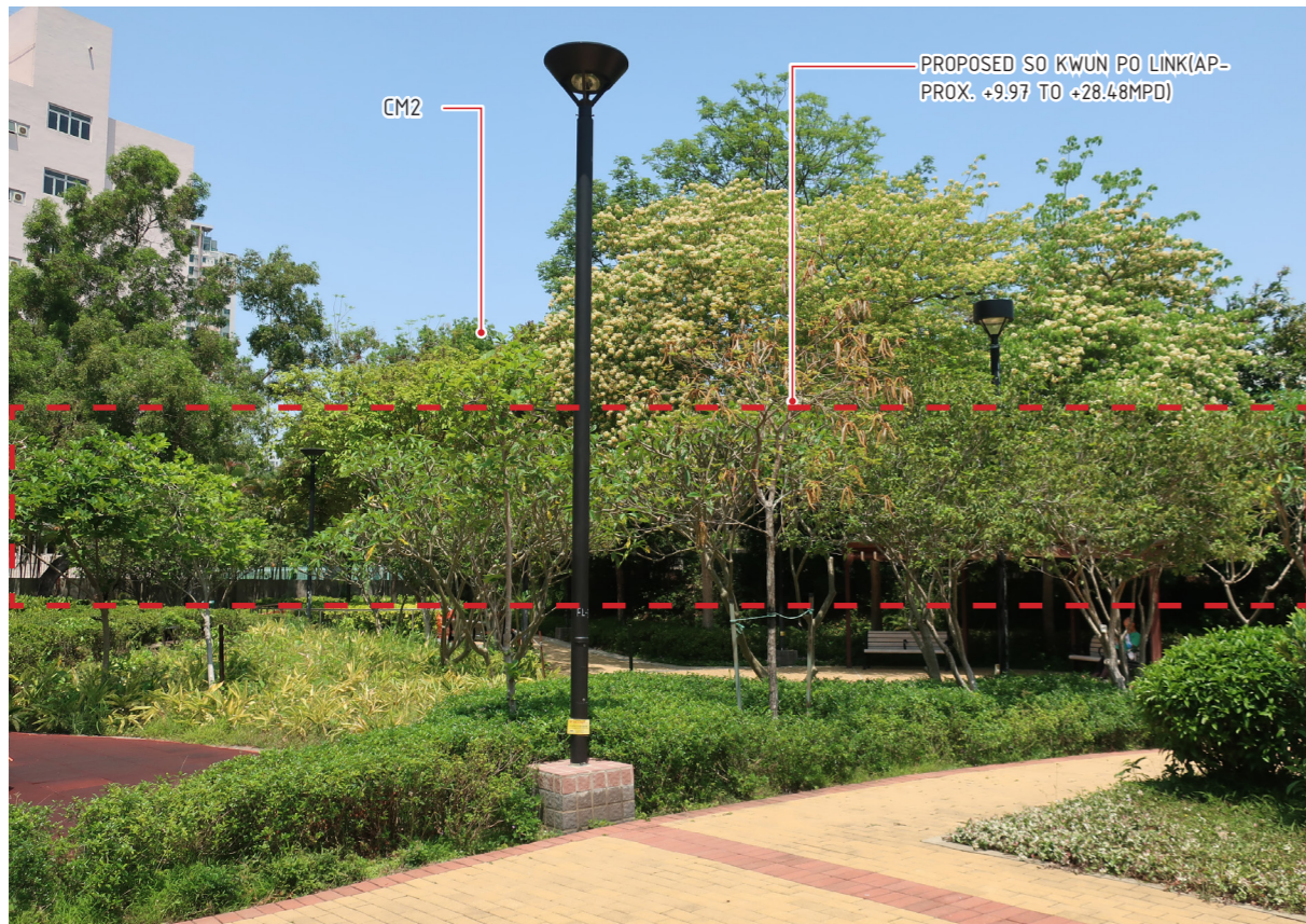
VP02 - KAT CHEUNG STREET GARDEN DAY 1 WITH MITGATION MEASURES