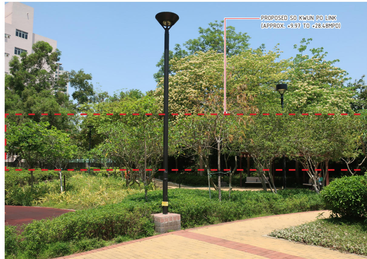
VP02 - KAT CHEUNG STREET GARDEN WITHOUT MITGATION MEASURES