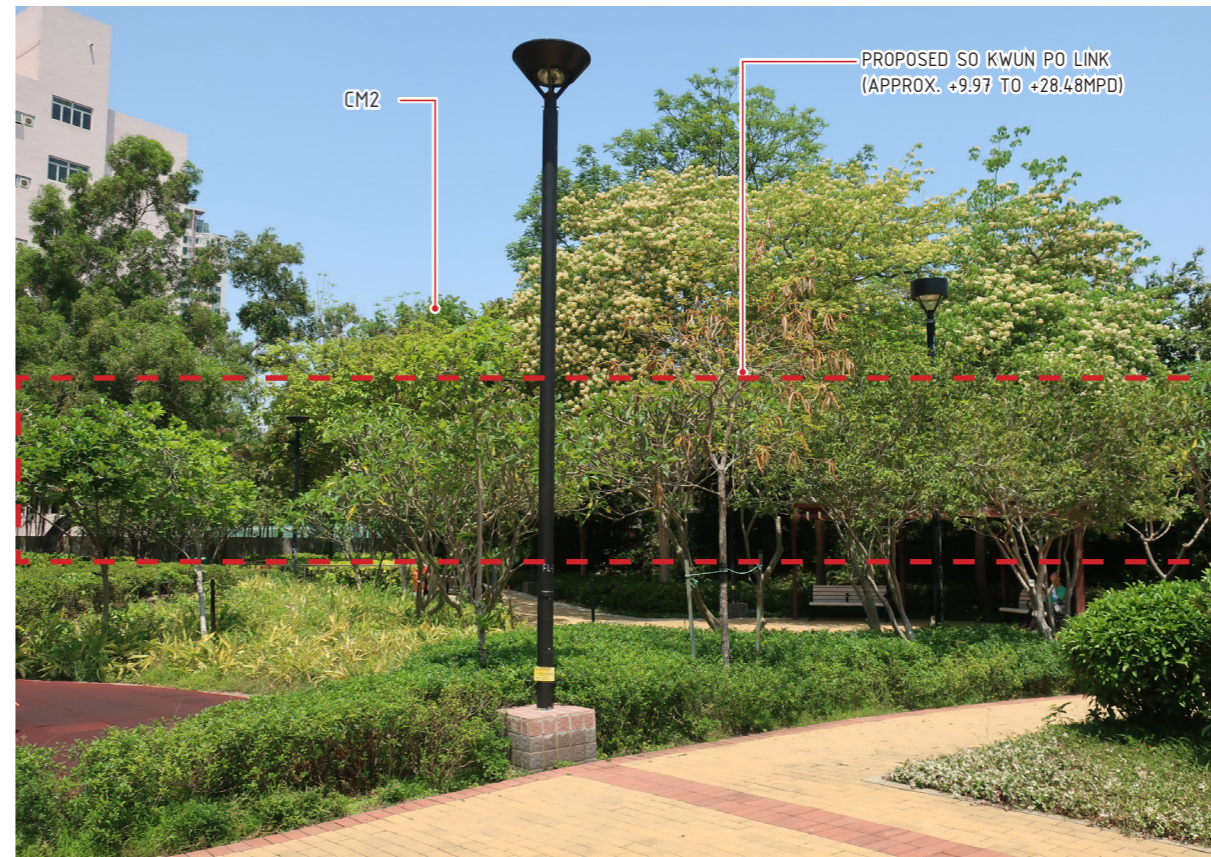
VP02 - KAT CHEUNG STREET GARDEN YEAR 10 WITH MITGATION MEASURES