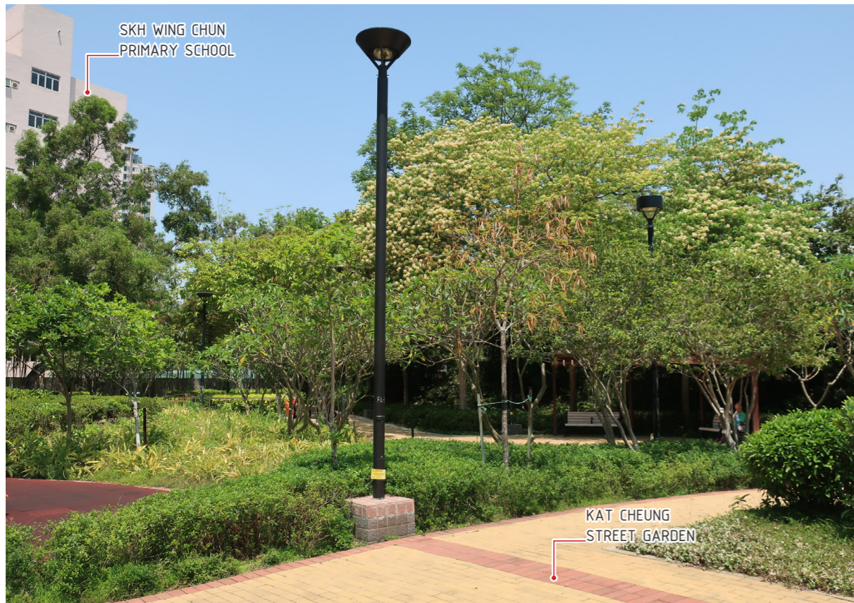
VP02 - KAT CHEUNG STREET GARDEN EXISTING CONDITION