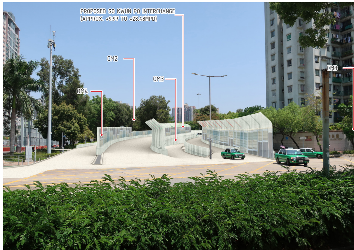
VP03 - WAI HON ROAD GARDEN DAY 1 WITH MITGATION MEASURES