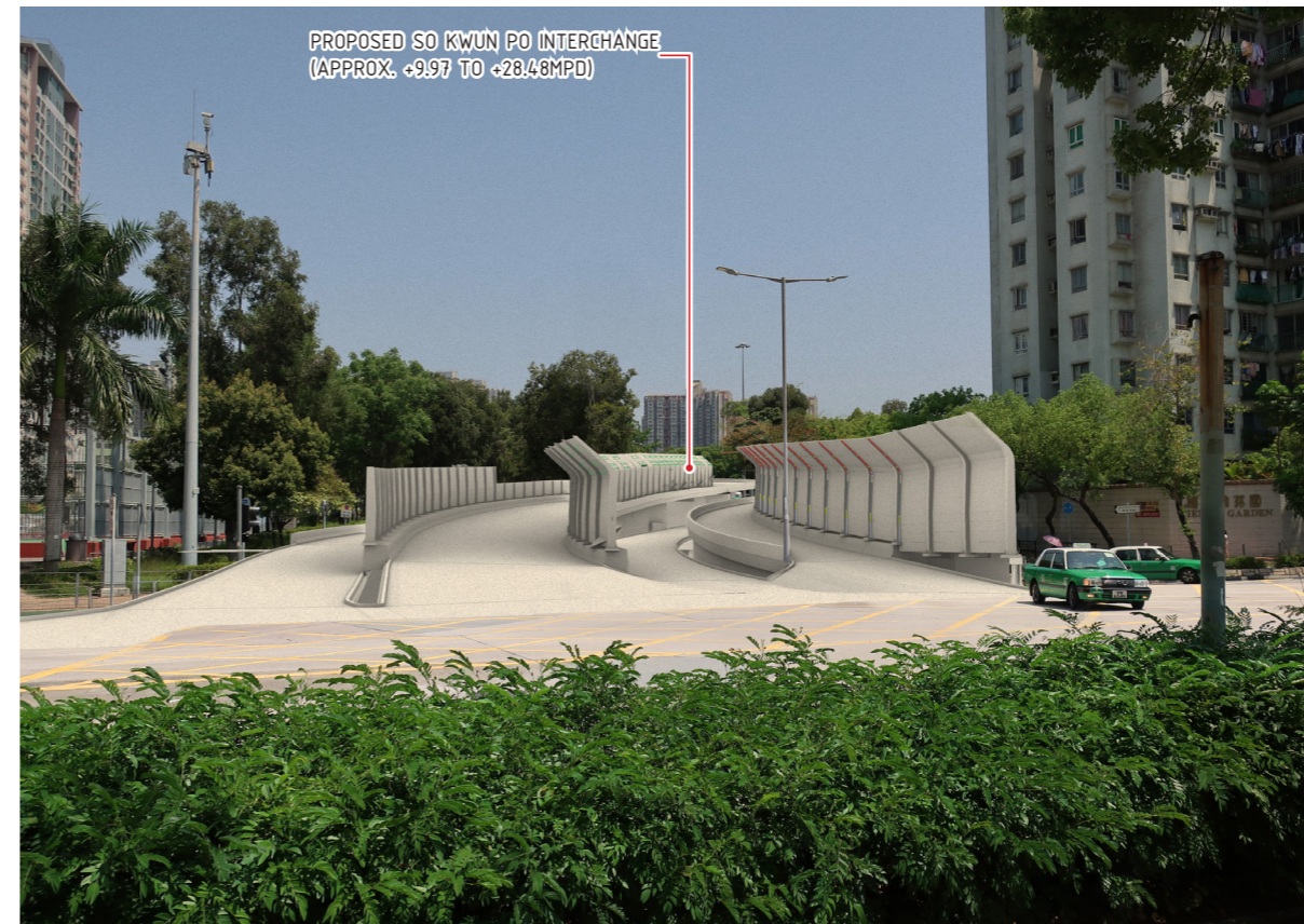
VP03 - WAI HON ROAD GARDEN WITHOUT MITGATION MEASURES