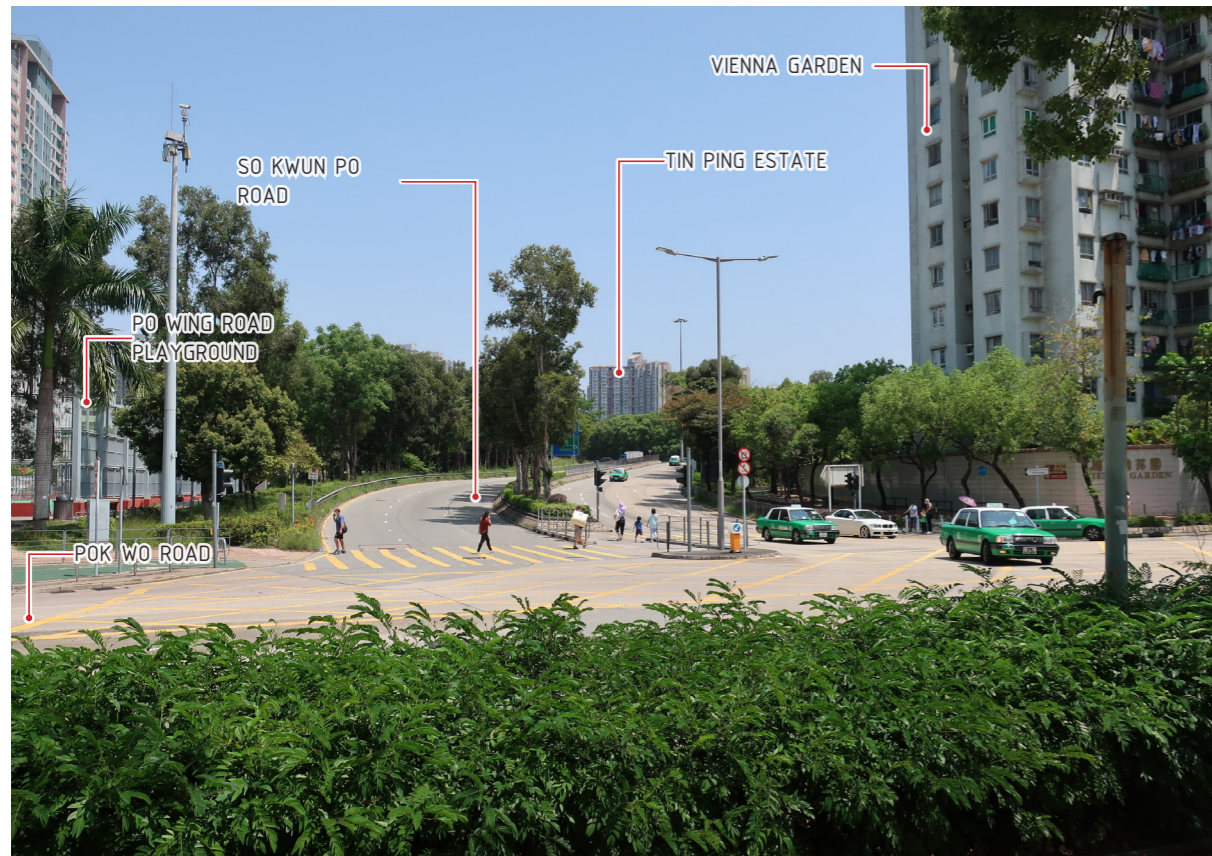
VP03 - WAI HON ROAD GARDEN EXISTING CONDITION