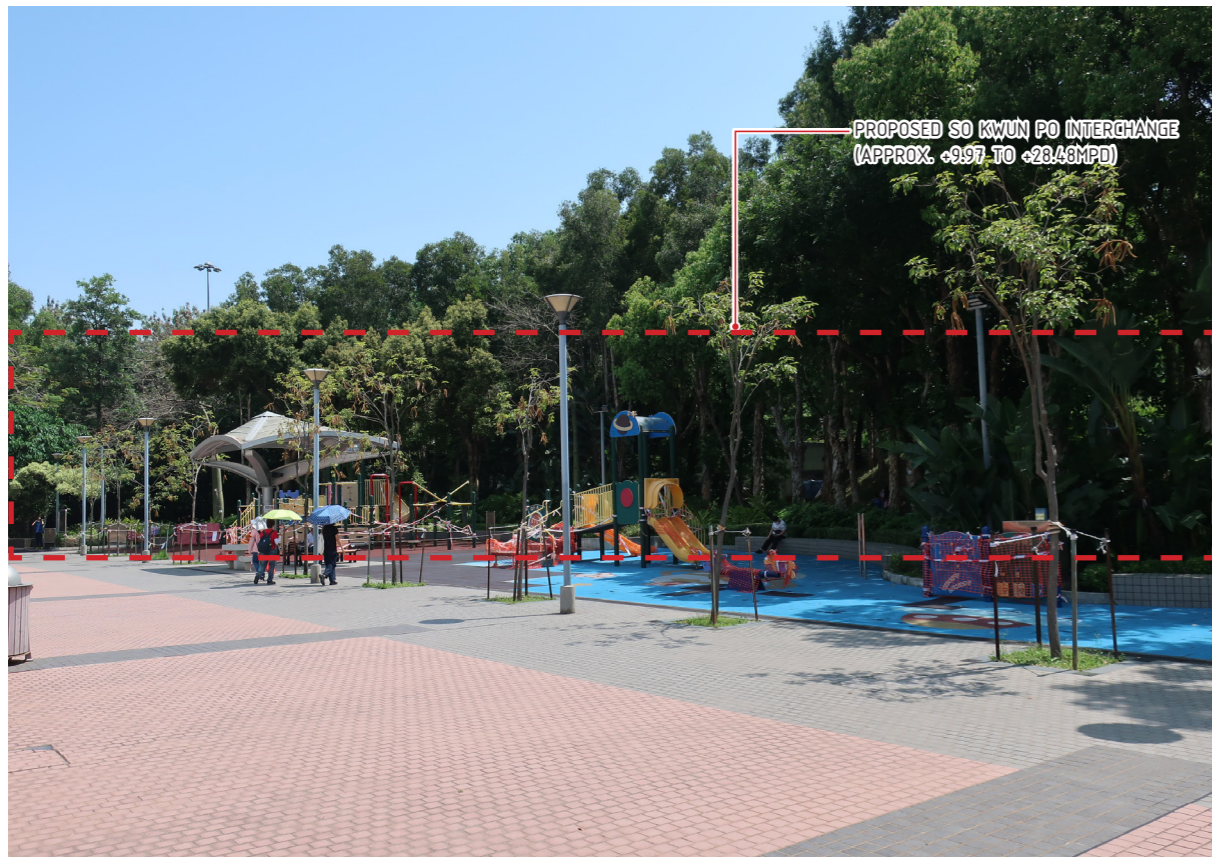
VP04 - PO WING ROAD PLAYGROUND DAY 1 WITH MITGATION MEASURES