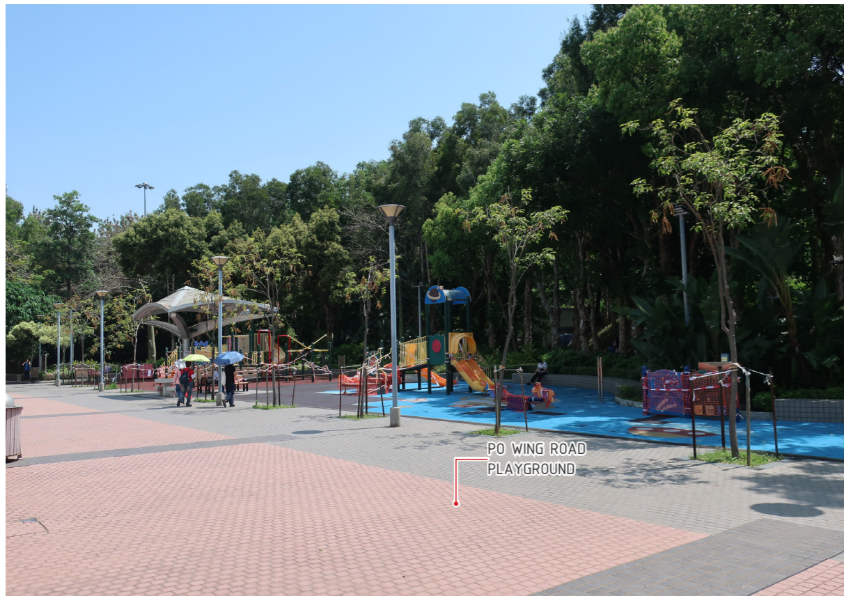
VP04 - PO WING ROAD PLAYGROUND EXISTING CONDITION