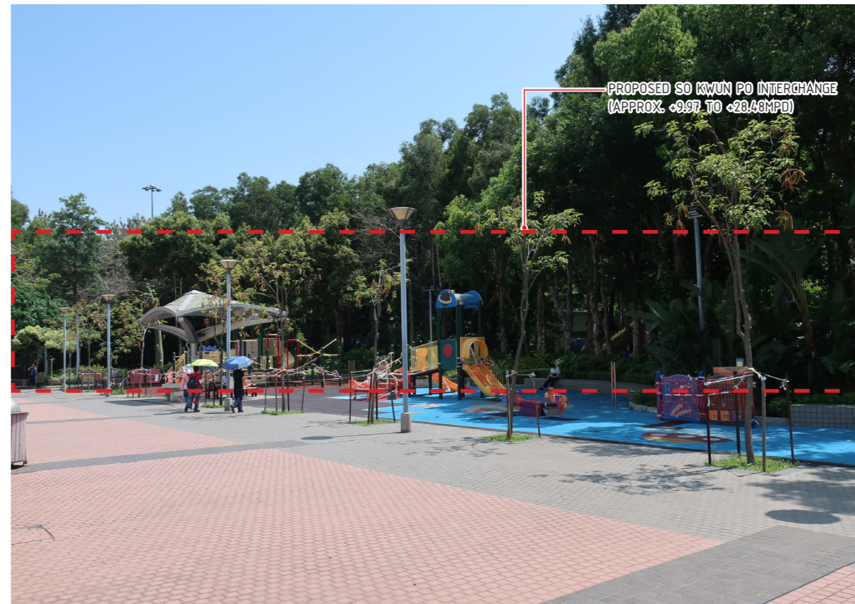
VP04 - PO WING ROAD PLAYGROUND WITHOUT MITGATION MEASURES