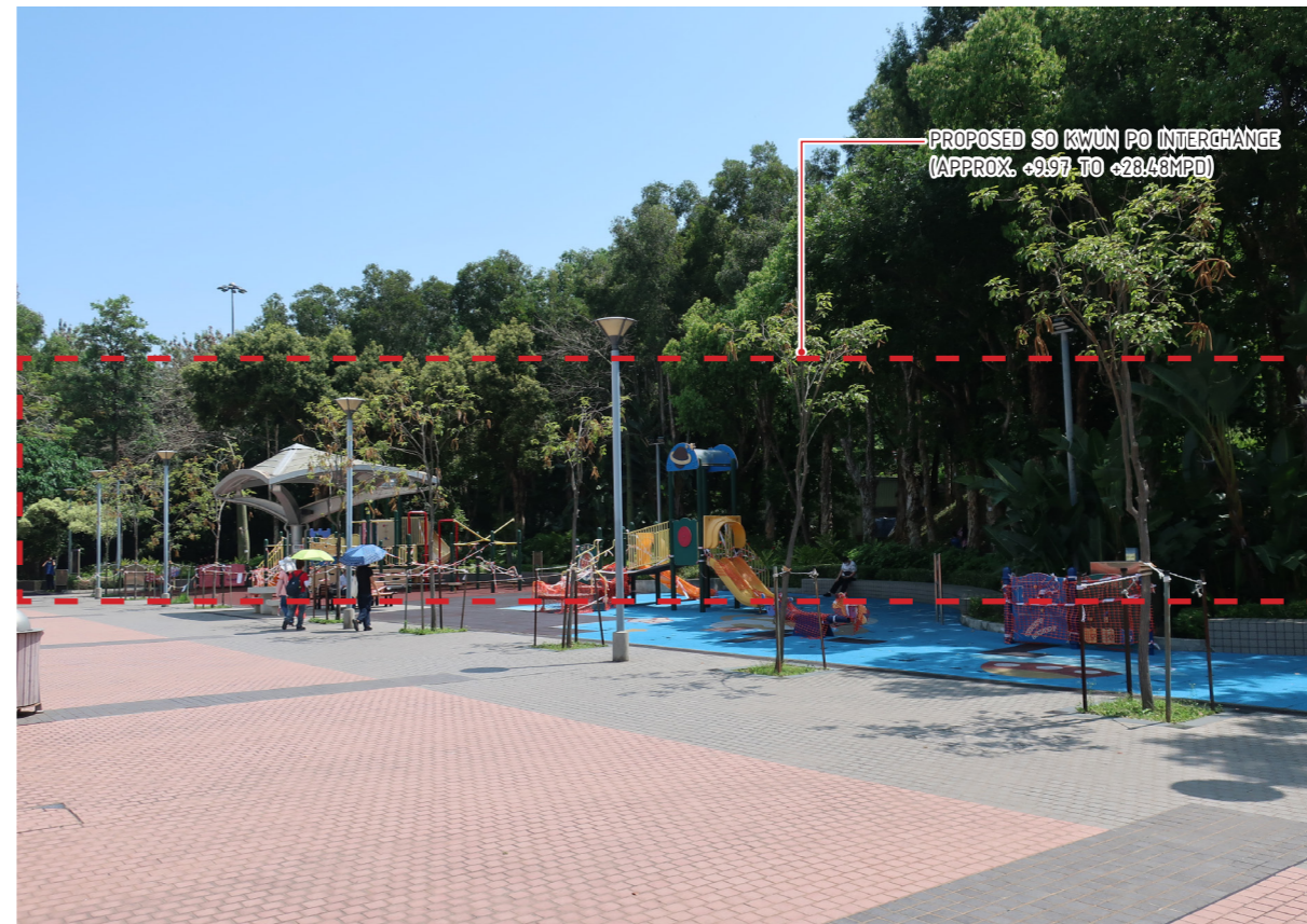
VP04 - PO WING ROAD PLAYGROUND YEAR 10 WITH MITGATION MEASURES