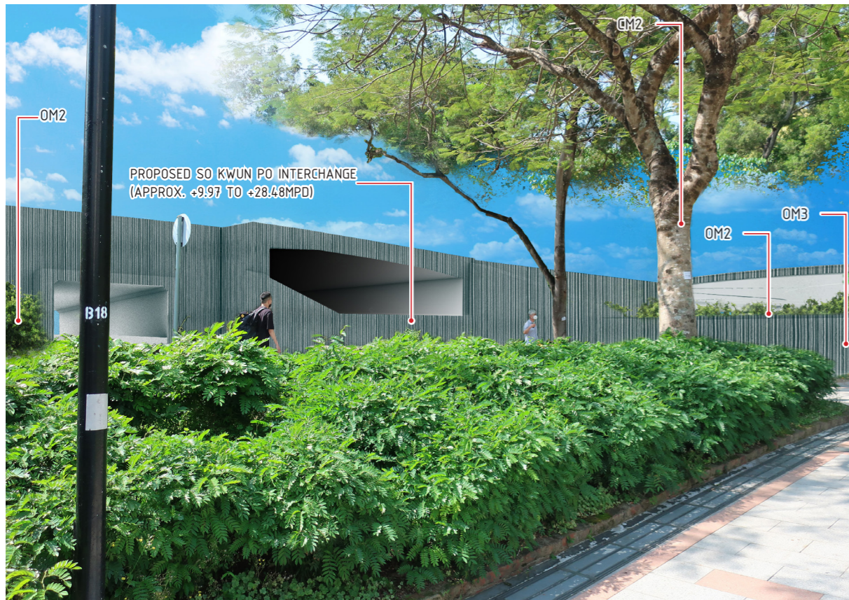
VP06 - NORTH DISTRICT PARK (VOLLEYBALL COURT) DAY 1 WITH MITGATION MEASURES