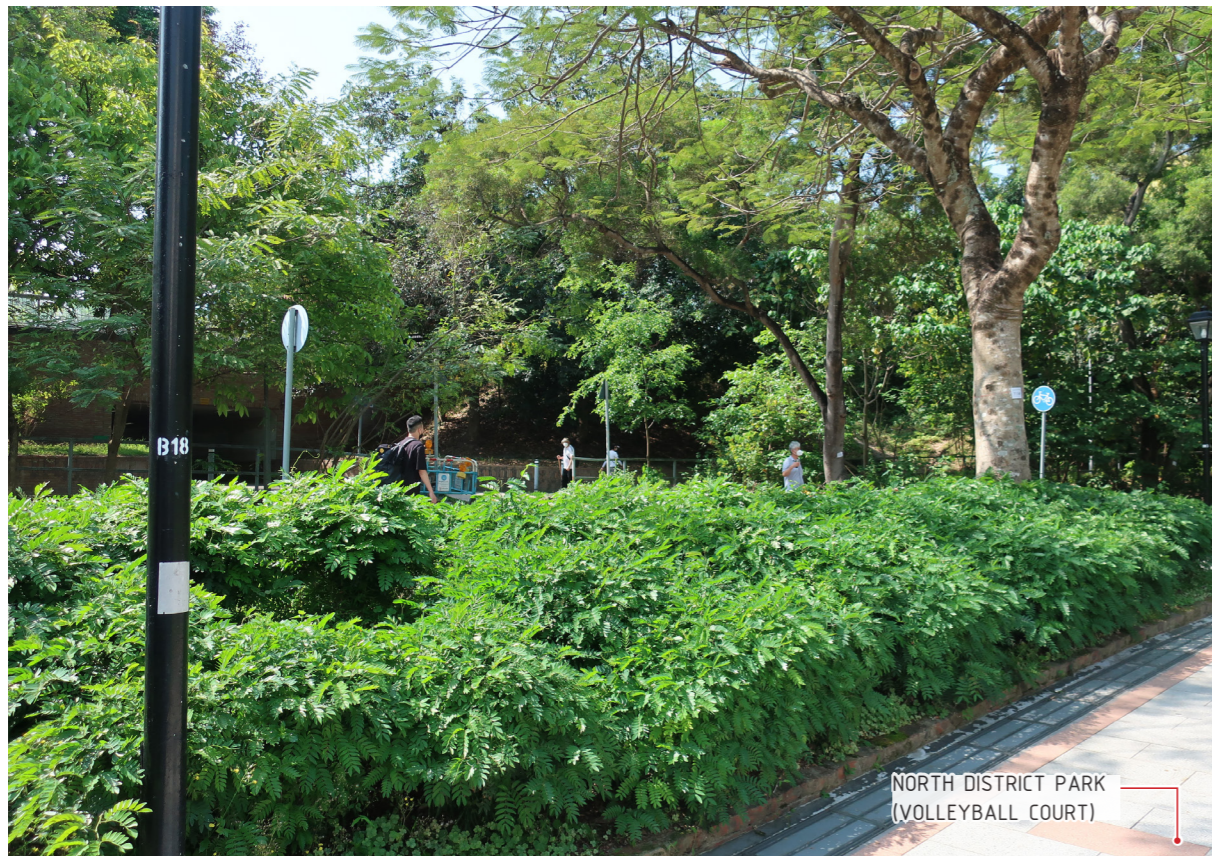
VP06 - NORTH DISTRICT PARK (VOLLEYBALL COURT) EXISTING CONDITION