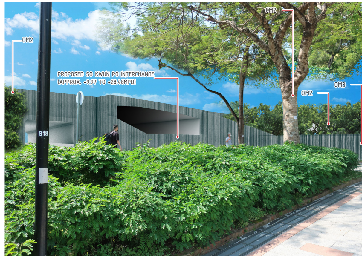
VP06 - NORTH DISTRICT PARK (VOLLEYBALL COURT) YEAR 10 WITH MITGATION MEASURES