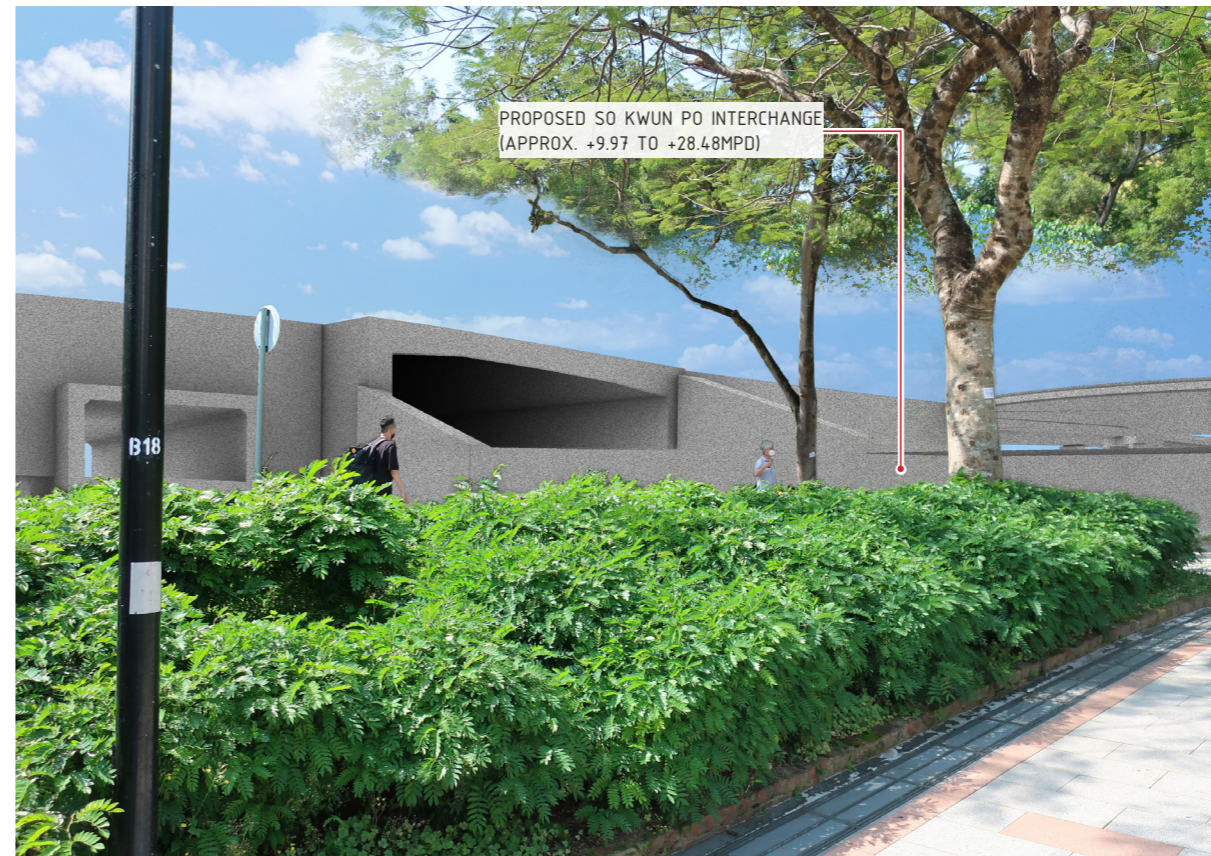
VP06 - NORTH DISTRICT PARK (VOLLEYBALL COURT) WITHOUT MITGATION MEASURES