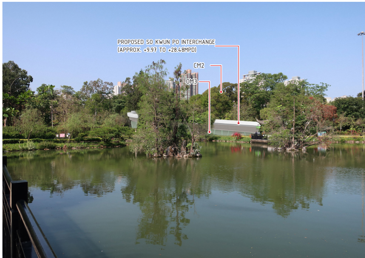
VP07 - NORTH DISTRICT PARK (EAST SIDE) DAY 1 WITH MITGATION MEASURES