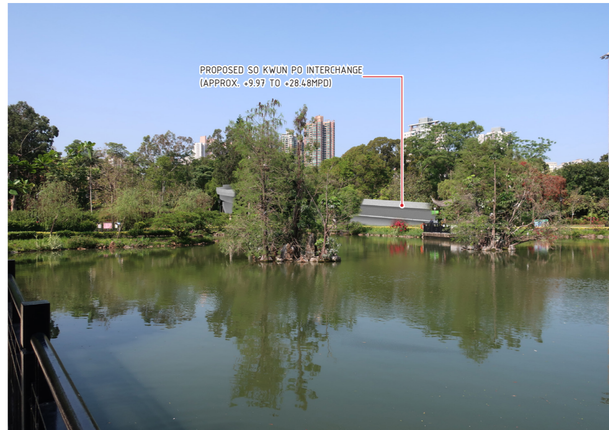
VP07 - NORTH DISTRICT PARK (EAST SIDE) WITHOUT MITGATION MEASURES