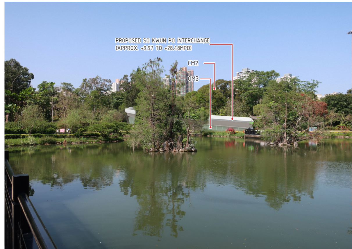
VP07 - NORTH DISTRICT PARK (EAST SIDE) YEAR 10 WITH MITGATION MEASURES