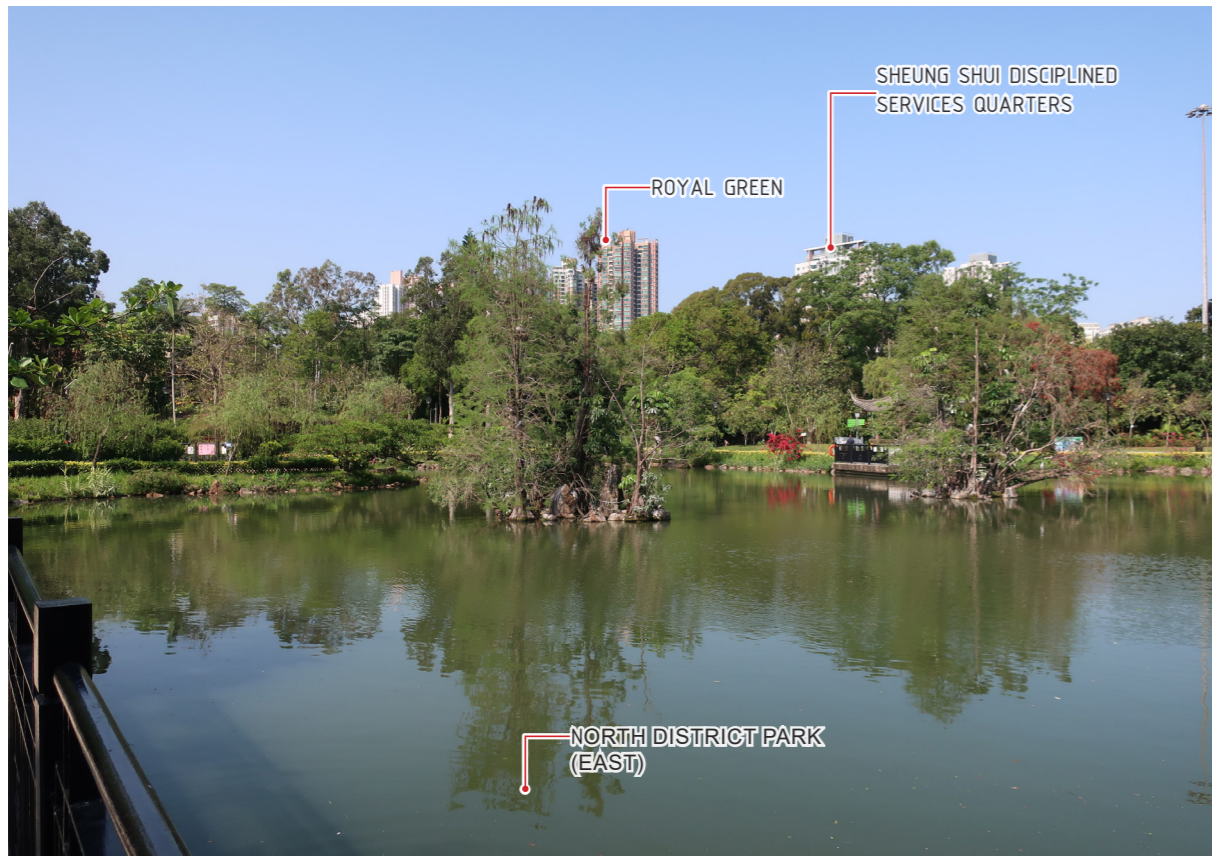
VP07 - NORTH DISTRICT PARK (EAST SIDE) EXISTING CONDITION