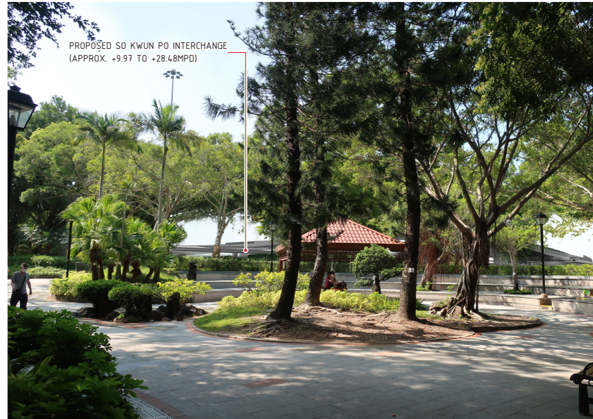
VP08 - NORTH DISTRICT PARK (WEST SIDE) WITHOUT MITGATION MEASURES