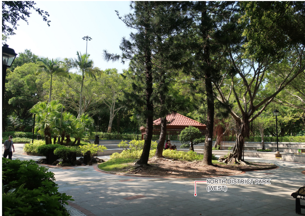
VP08 - NORTH DISTRICT PARK (WEST SIDE) EXISTING CONDITION