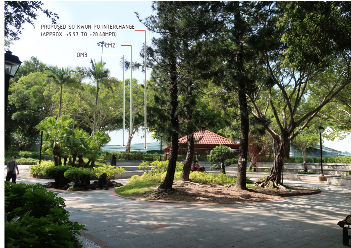
VP08 - NORTH DISTRICT PARK (WEST SIDE) YEAR 10 WITH MITGATION MEASURES