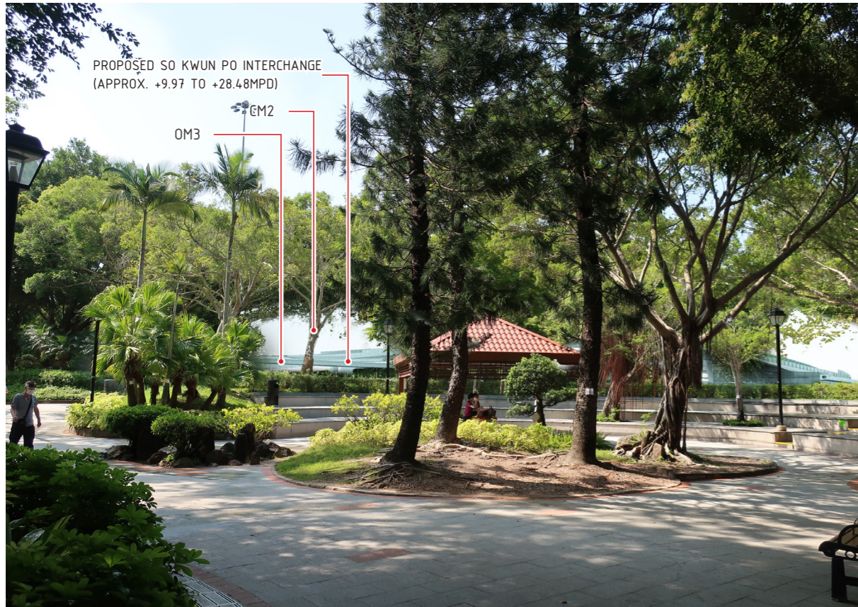
VP08 - NORTH DISTRICT PARK (WEST SIDE) DAY 1 WITH MITGATION MEASURES