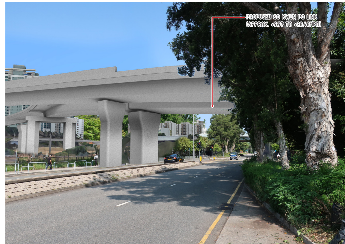
VP09 - BUS STOP AT SAN WAN ROAD (EAST) WITHOUT MITGATION MEASURES