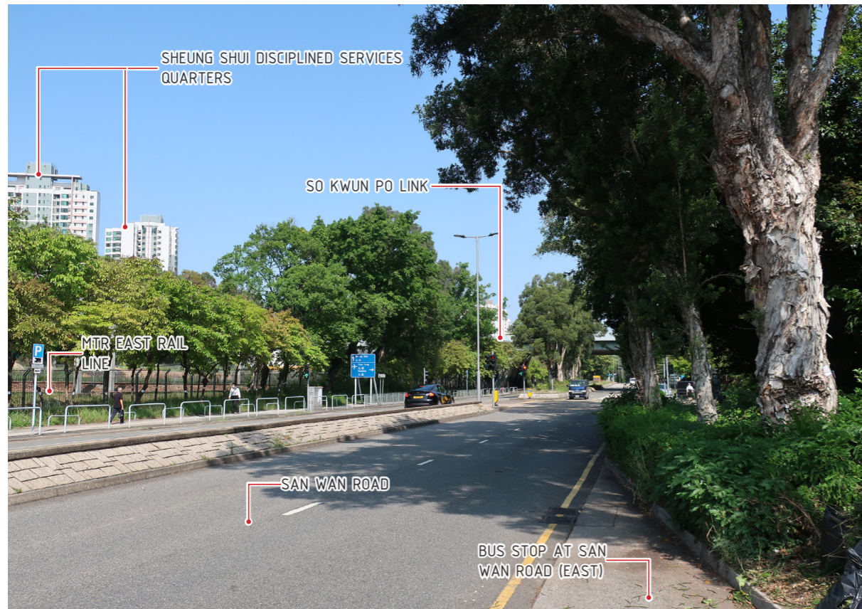
VP09 - BUS STOP AT SAN WAN ROAD (EAST) EXISTING CONDITION