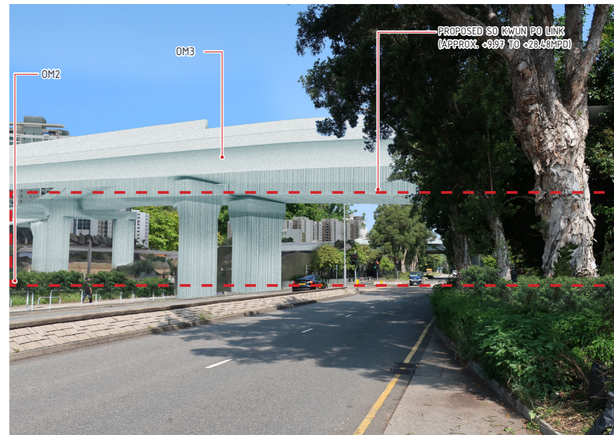
VP09 - BUS STOP AT SAN WAN ROAD (EAST) YEAR 10 WITH MITGATION MEASURES