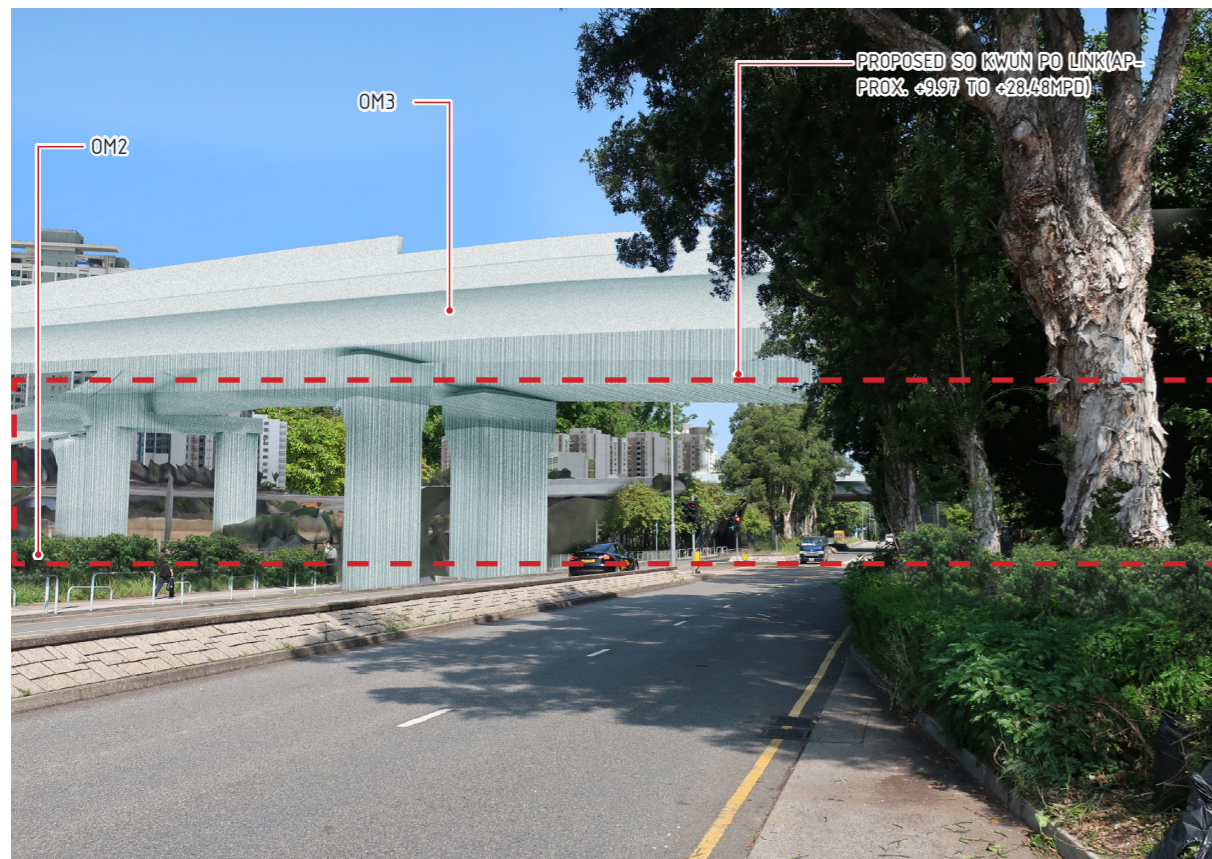
VP09 - BUS STOP AT SAN WAN ROAD (EAST) DAY 1 WITH MITGATION MEASURES