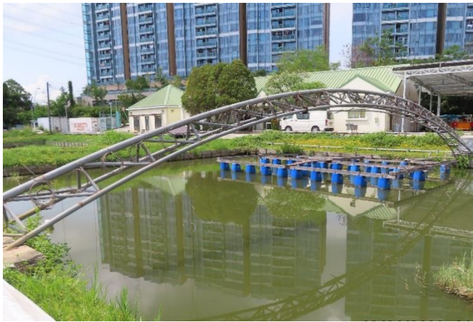
Fishponds within AFCD Au Tau Fisheries Office