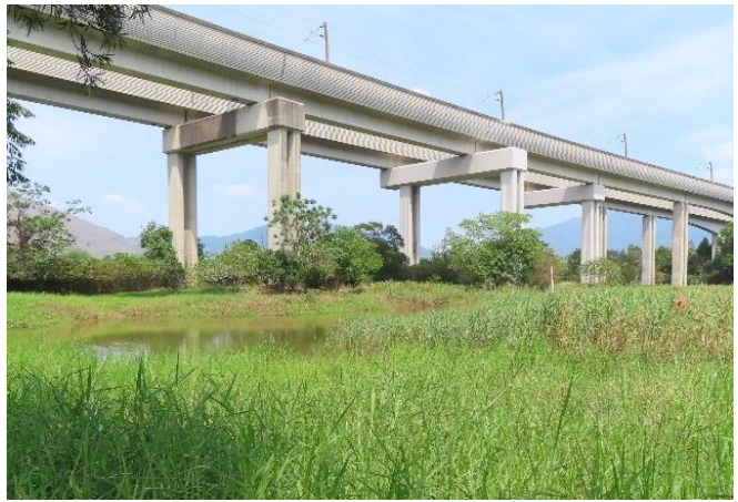
West Rail Compensatory Wetland