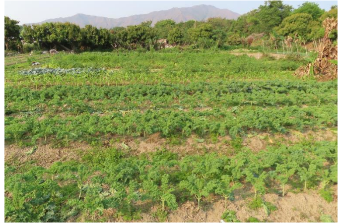
Dry Agricultural Land