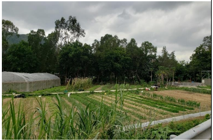
Dry Agricultural Land