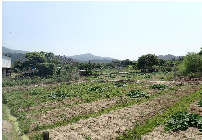
Dry Agricultural Land