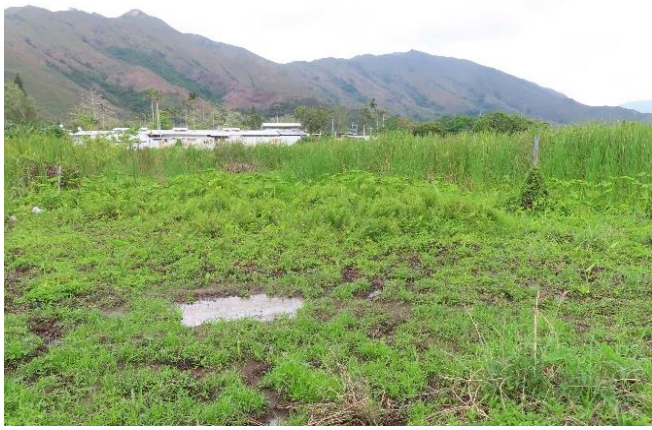
Seasonally Wet Grassland