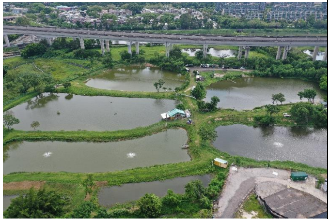
Active Fishponds south of Cheung Chun San Tsuen