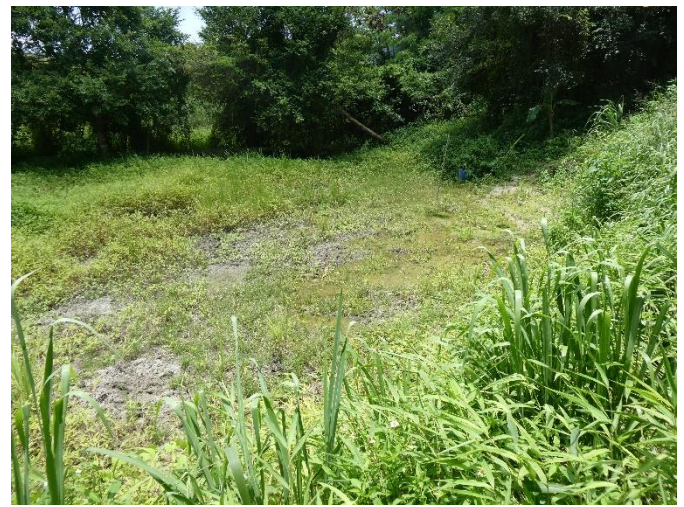
Seasonally Wet Grassland