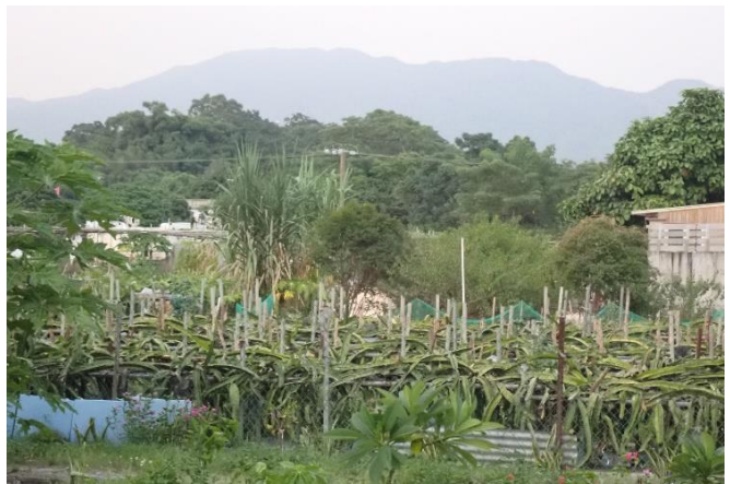
Dry Agricultural Land