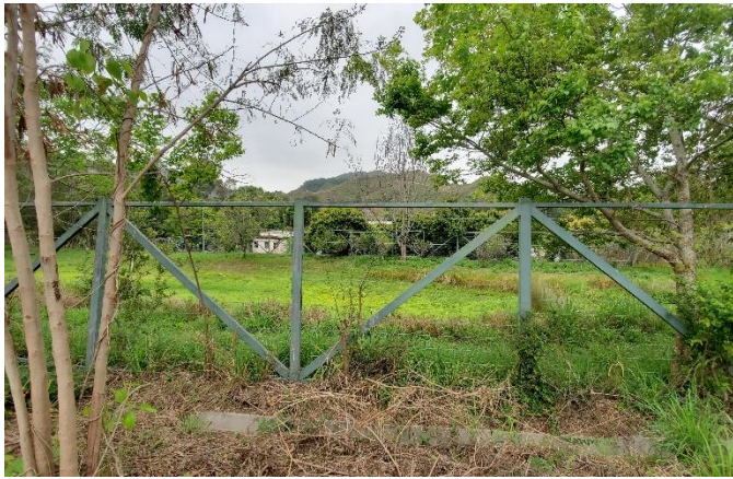
West Rail Compensatory Wetland