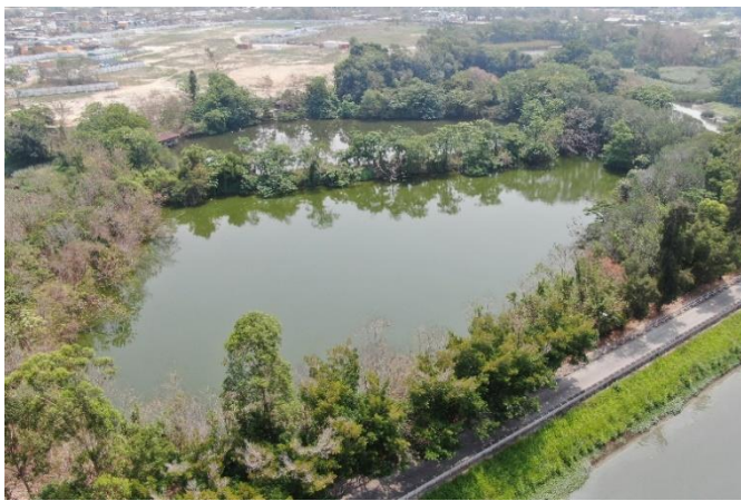
Inactive Fishponds south of Cheung Chun San Tsuen