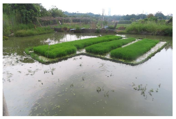
Wet Agricultural Land