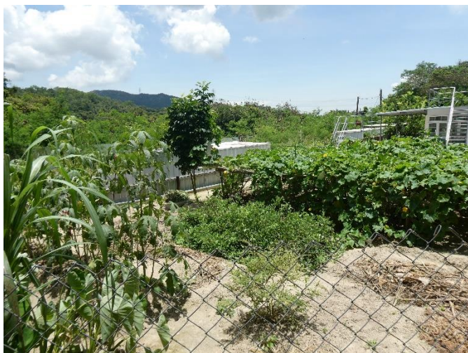
Dry Agricultural Land