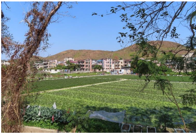
Dry Agricultural Land