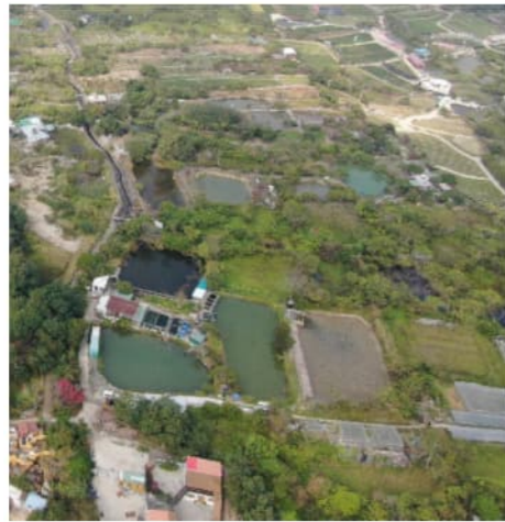
LR3.2- PONDS AROUND SIU HUM TSUEN AND SHEK WU WAI SAN TSUEN