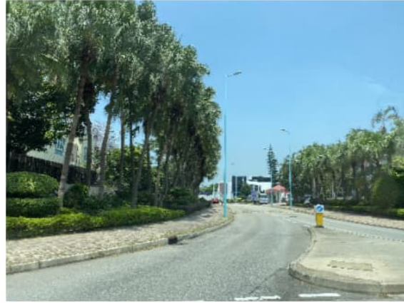
LR16 - DEVELOPED AREA