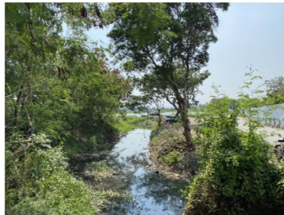
LR6 - SEMI-NATURAL WATERCOURSE