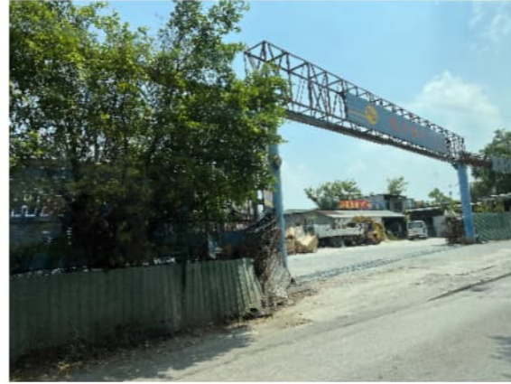
LR17 - WASTE LAND / OPEN STORAGE / TEMPORARY AREA