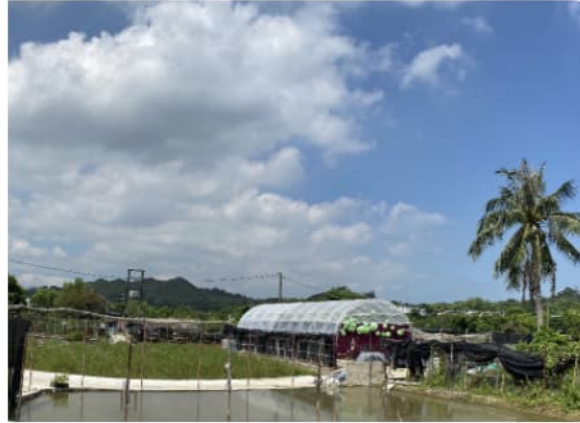
LR8 - WET AGRICULTURAL LAND