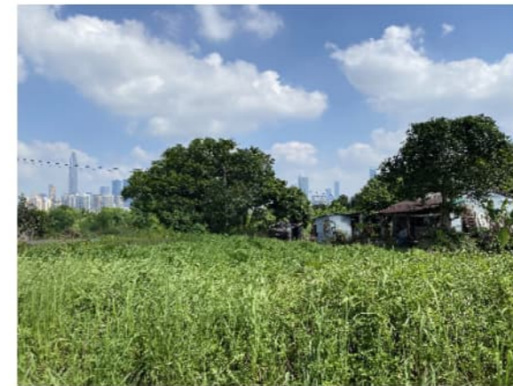
LR7 - SEASONAL WET GRASSLAND