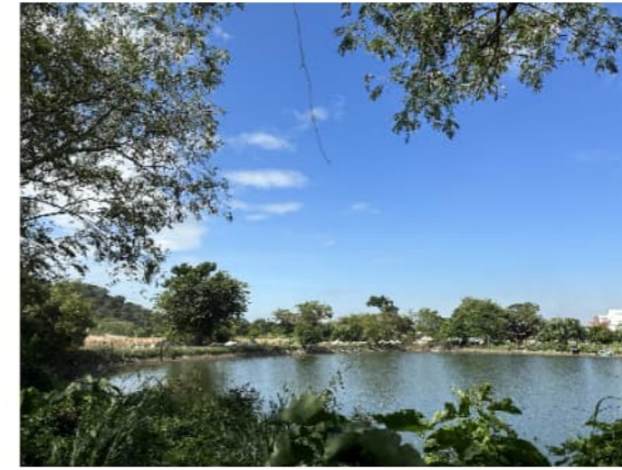
LR3.1- PONDS AROUND SAN TIN AND SAM PO SHUE