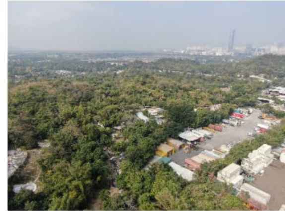
LR11 - MIXED WOODLAND