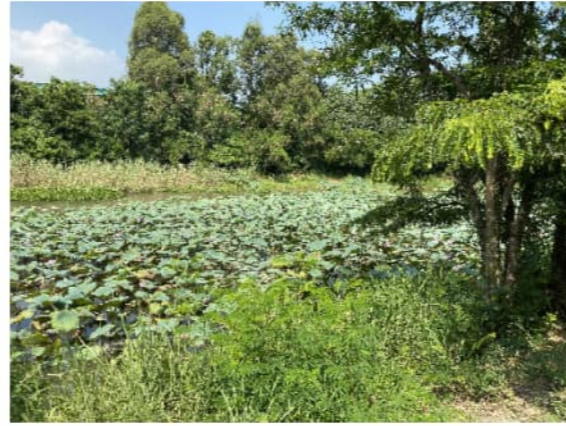
LR2 - COMPENSATORY WETLAND