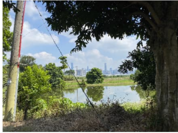
LR1 - MARSH/ REED