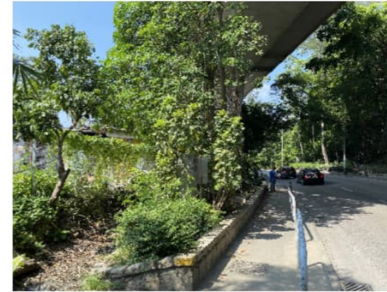
LR12.2 - PLANTATION ALONG ROADSIDE