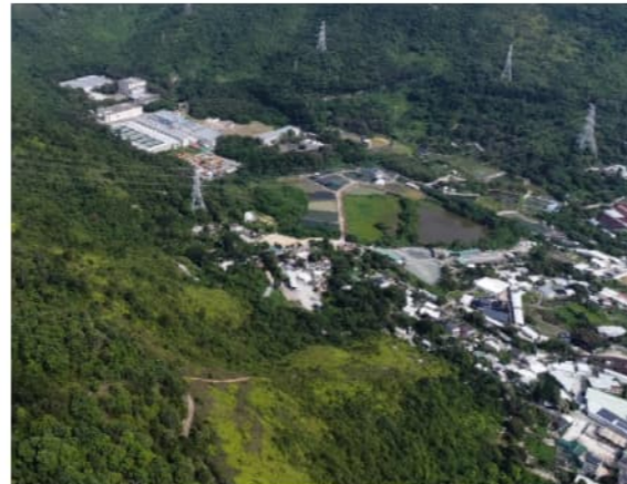
LR3.3 - PONDS NEAR NGAU TAM MEI