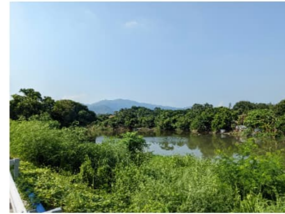
LR4 - NATURAL WATERCOURSE