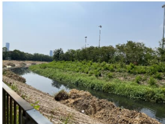
LR5 - MODIFIED WATERCOURSE