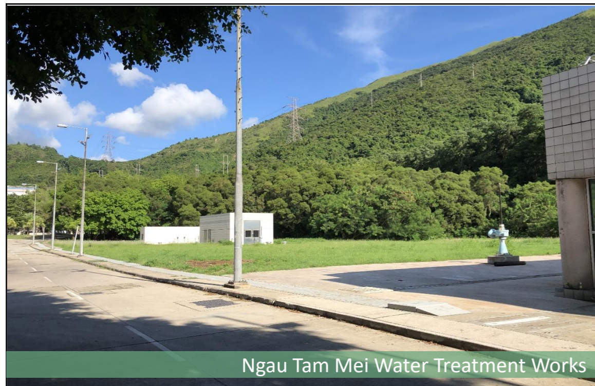
Ngau Tam Mei Water Treatment Works