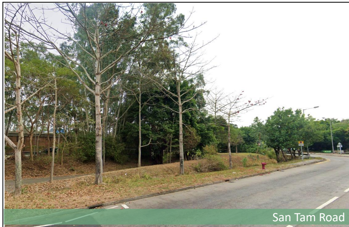
San Tam Road