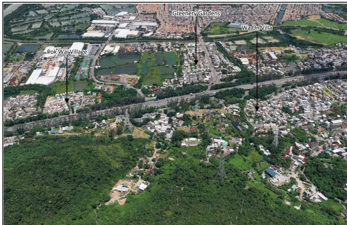
LCA3 – Urban Peripheral Village LCA