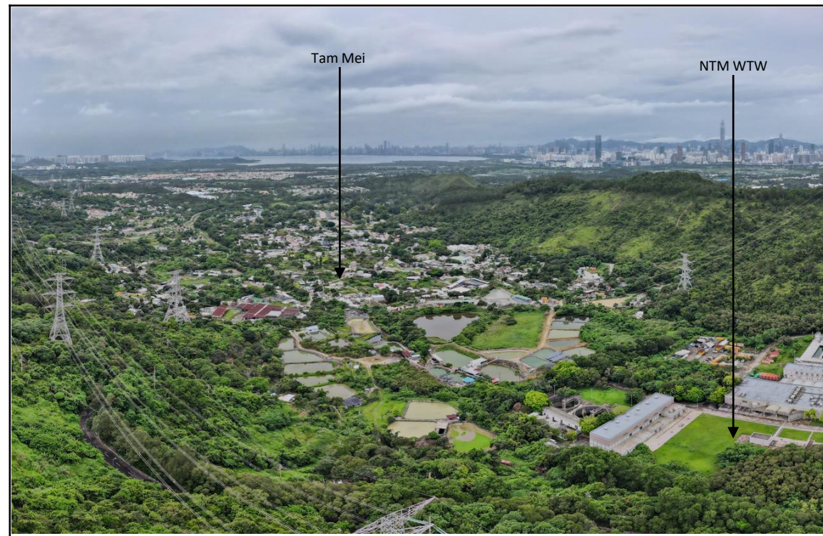
LCA3 – Urban Peripheral Village LCA