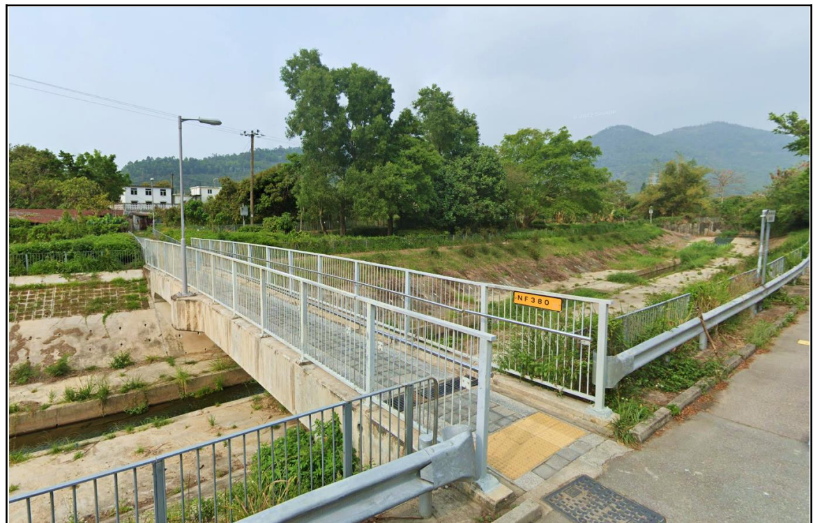
LCA2 – River Channel LCA