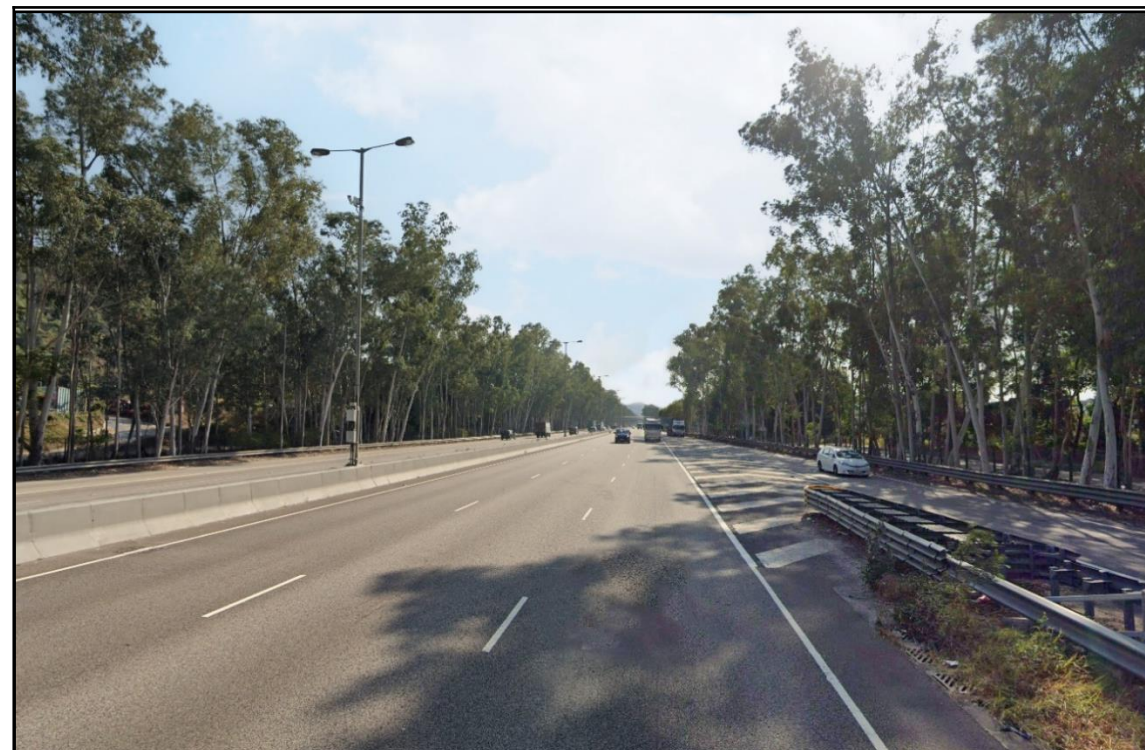
LCA5 – San Tin Highway