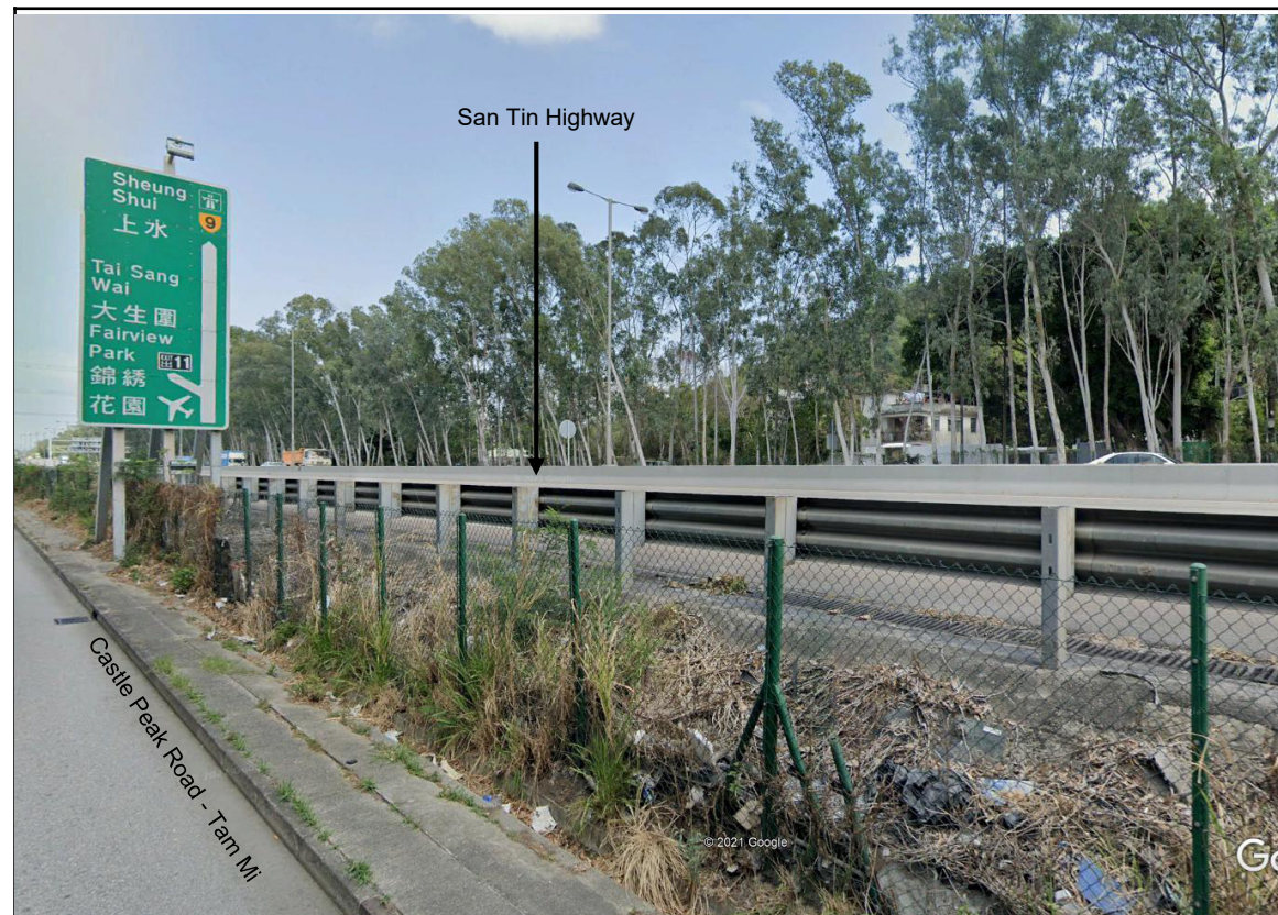
VSR R3 – Residents in Pok Wai and nearby residential developments