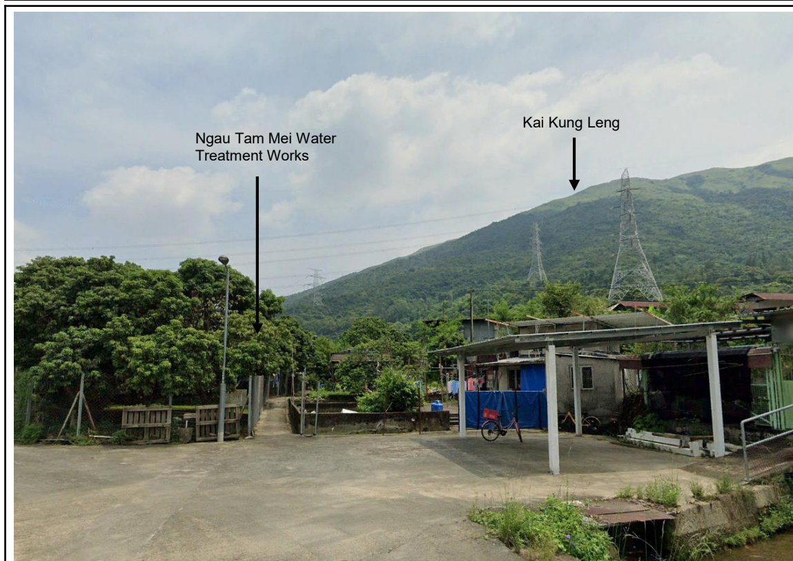
VSR R1 – Residents in village of Yau Tam Mei Tsuen (II)