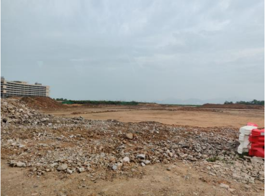
Wasteland (Project Site)