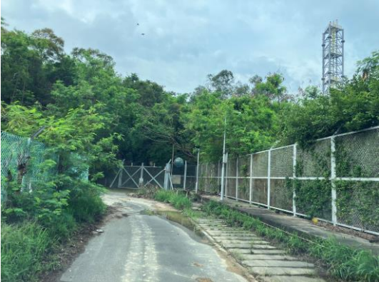
Developed Area (Project Site)