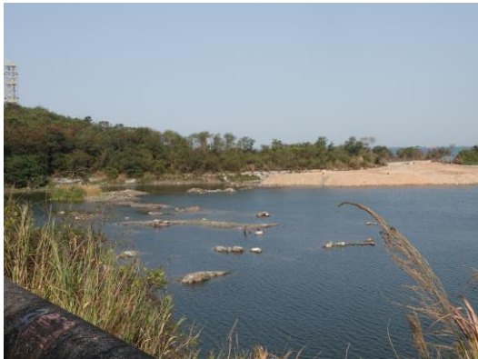
Ash Lagoon (Project Site)