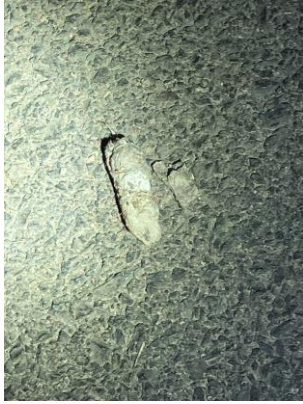
Leopard Cat (Scats)