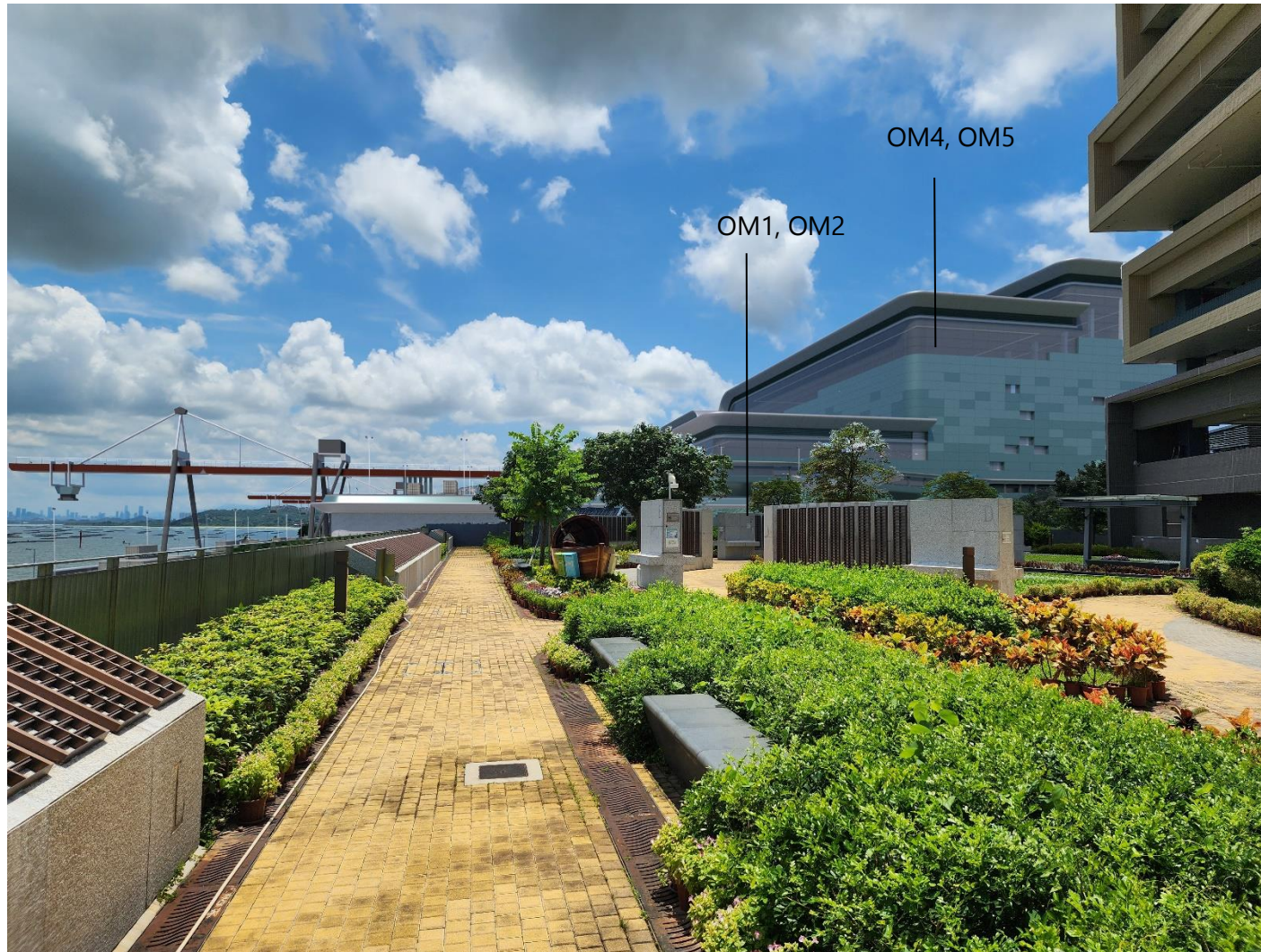
Development With Mitigation - VP2 Visitors at Tsang Tsui Columbarium (G/F Garden)