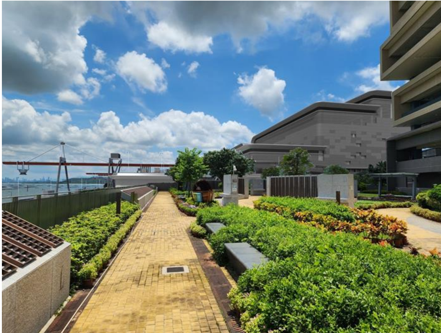
Development Without Mitigation - VP2 Visitors at Tsang Tsui Columbarium (G/F Garden)