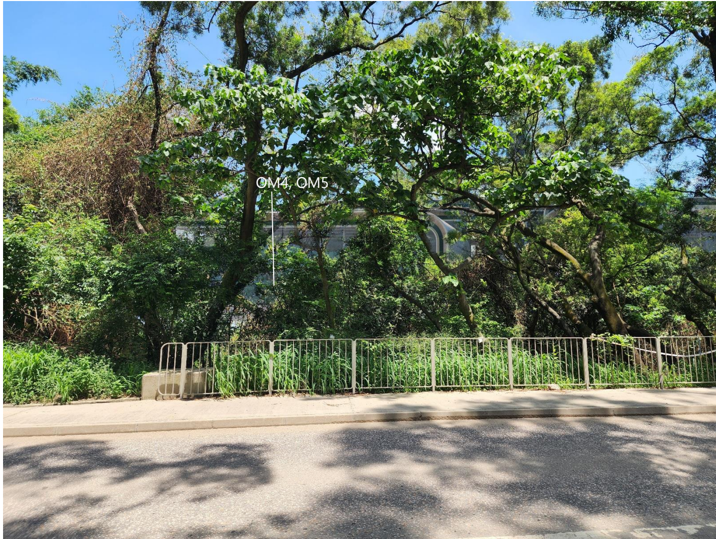
Development With Mitigation - VP4 Travellers along Nim Wan Road