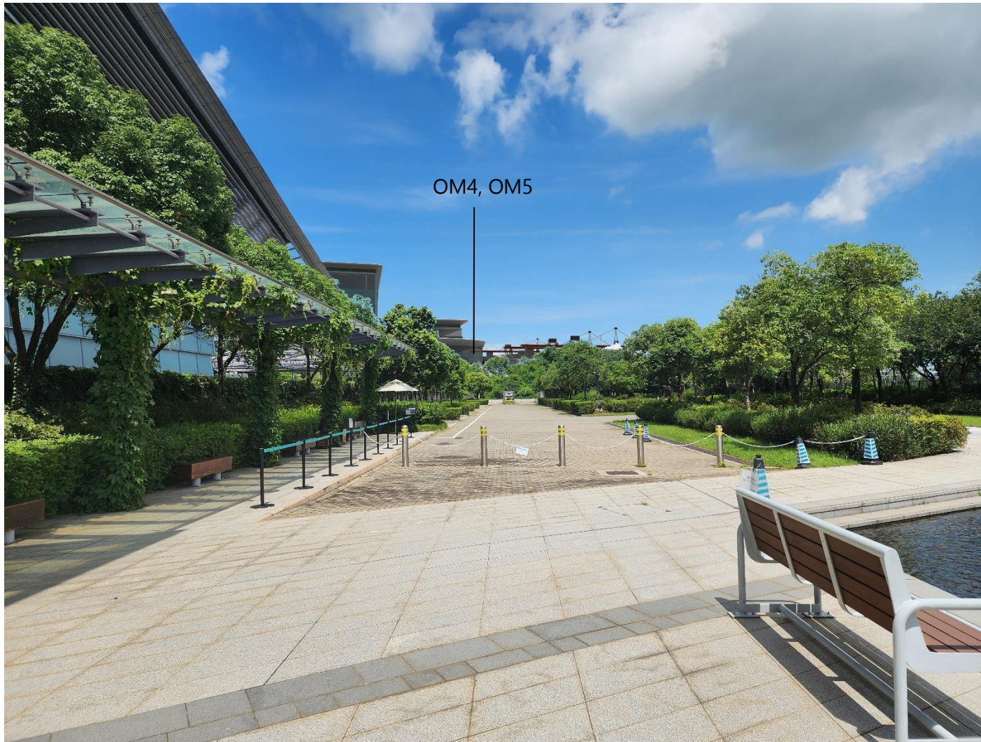
Development With Mitigation - VP3 Visitors at T-PARK (G/F Garden)

Photomontages of Key Public Viewing Points | Appendix 9C