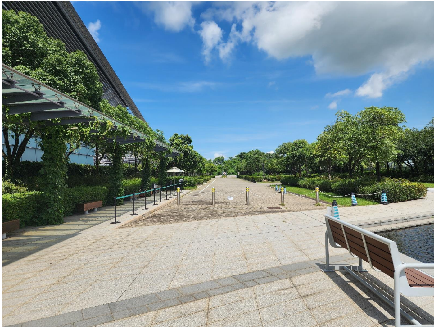
Baseline Condition - VP3 Visitors at T-PARK (G/F Garden)