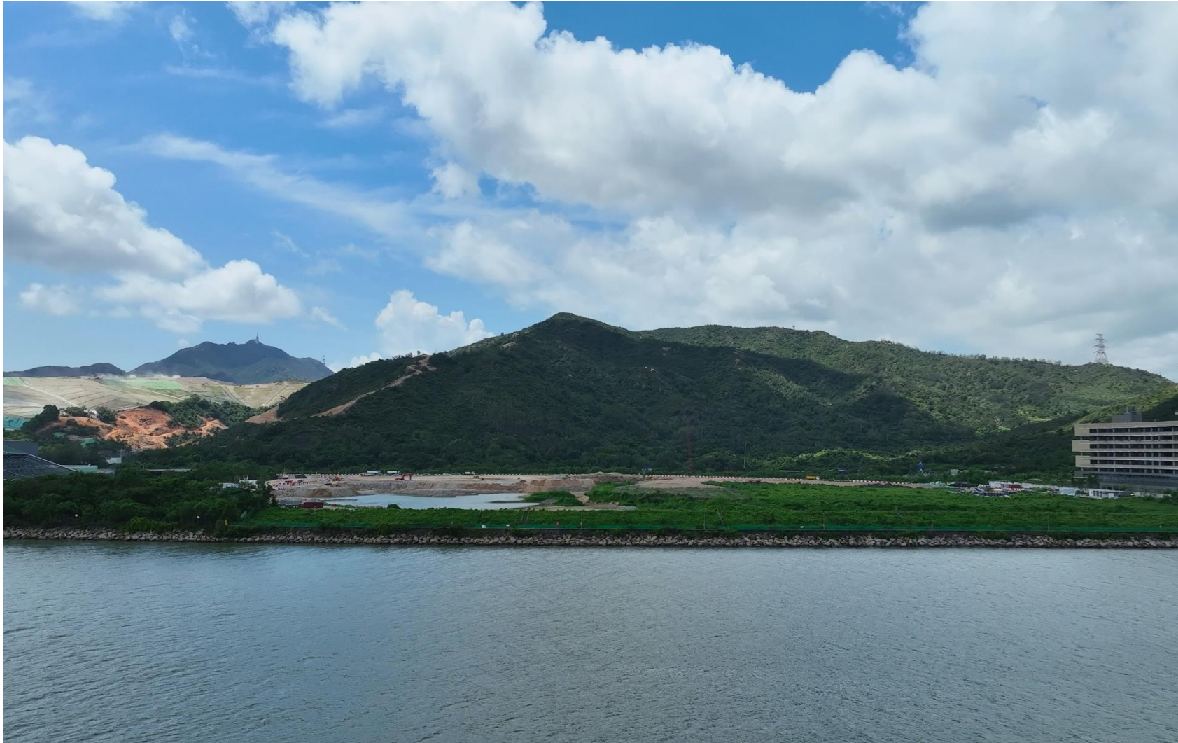
Baseline Condition - VP1 Sea Travellers