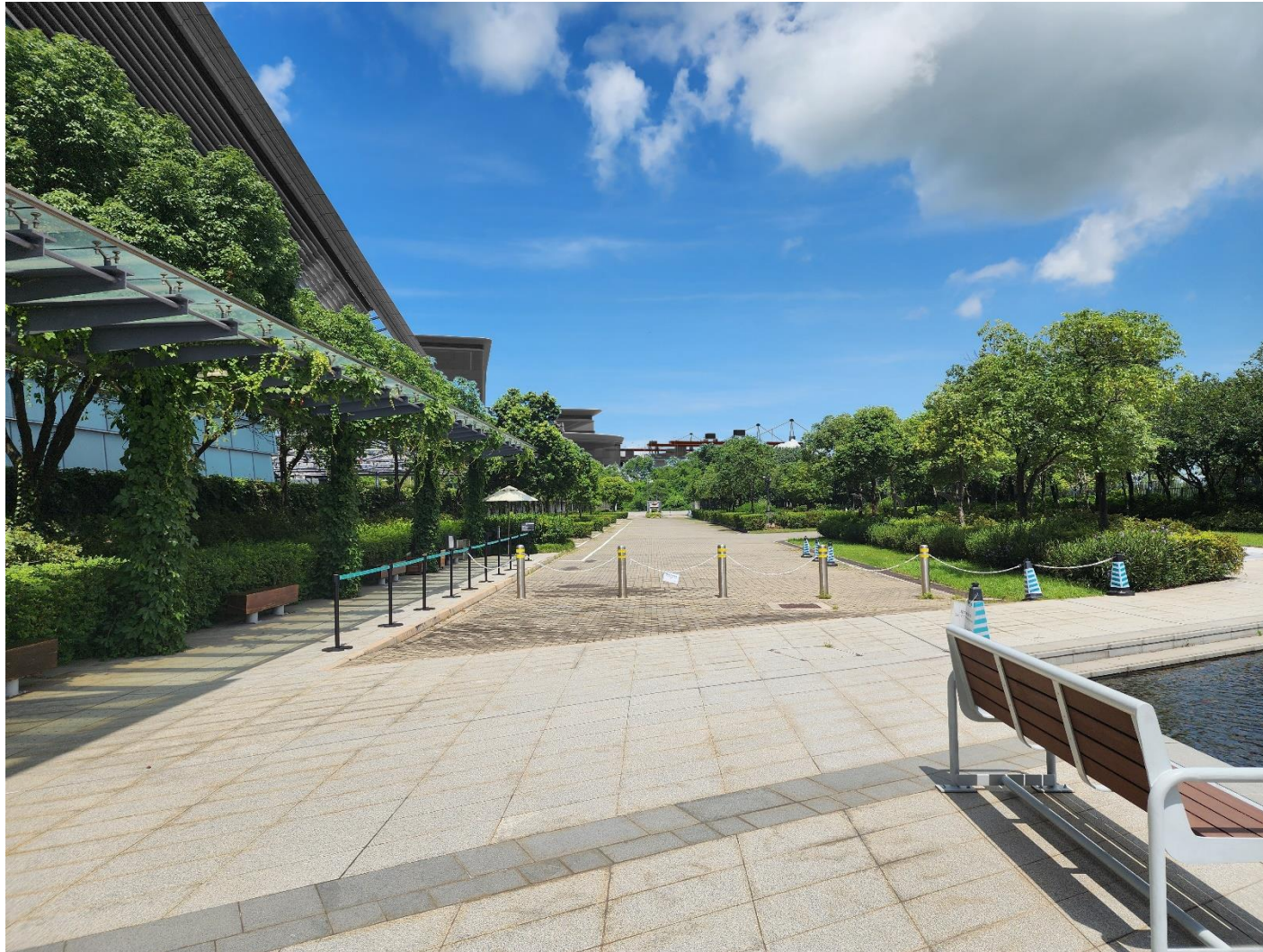
Development Without Mitigation - VP3 Visitors at T-PARK (G/F Garden)