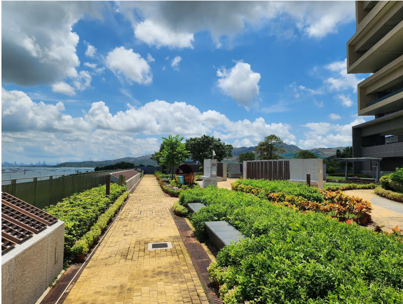
Baseline Condition - VP2 Visitors at Tsang Tsui Columbarium (G/F Garden)