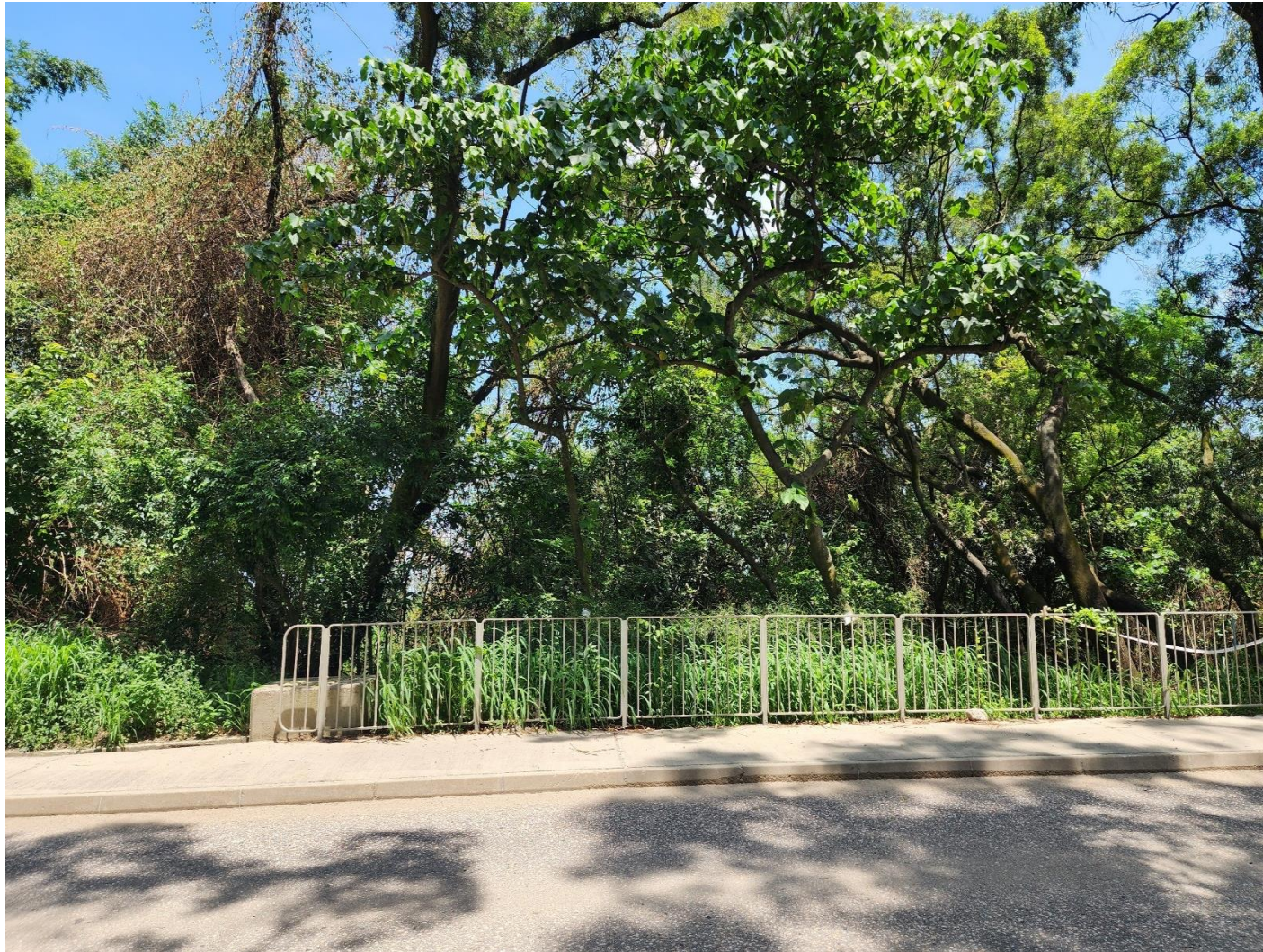
Baseline Condition - VP4 Travellers along Nim Wan Road