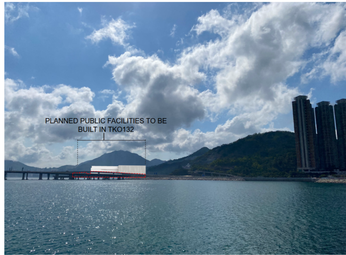
DAY 1 WITHOUT MITIGATION