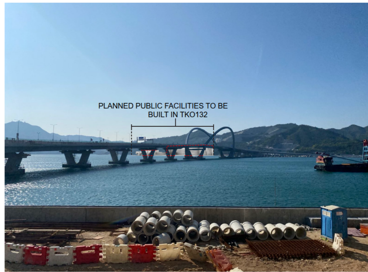
DAY 1 WITHOUT MITIGATION